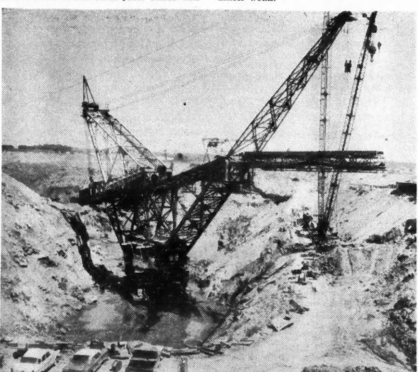
STRIP-MINING MACHINES LIKE THIS SWALLOWED UP THE JORS The skills of the old-time miners are replaced by electrical monsters

For decades output was dominated by several large railroad carriers. Underproduction and high consumer prices were the rule. Artificial scarcities were maintained as a matter of policy. Immigrants were encouraged to flock to the region to create labor surpluses as a means of keeping wages low and the union weak.