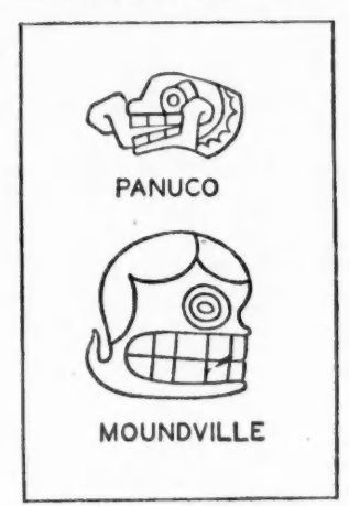
REPEATED MOTIFS From ancient cities in Mexico and U.S.

If the moral nature of man arises out of the fact that he is a social and value-creating (or