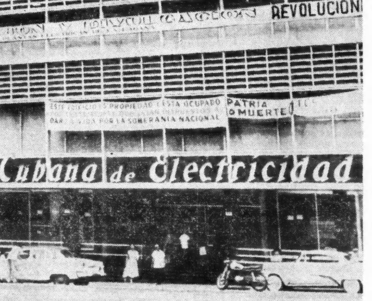
WE ARE READY TO GIVE OUR LIVES IN DEFENSE OF OUR SOVEREIGNTY So says the banner on the building of the nationalized power company

Employes at the huge Bacardi distillery-brewery told me: "We have no raw material or machinery problems whatever." The plant already has much European machinery—German, Czech, Brit-ish, French, Swedish—and they know how good it is. Storerooms are stacked with malt from Canada, hopcake from Czechoslovakia and Yugoslavia, "The only trouble here," they said, "is what those Yanquis may try to do . . ."