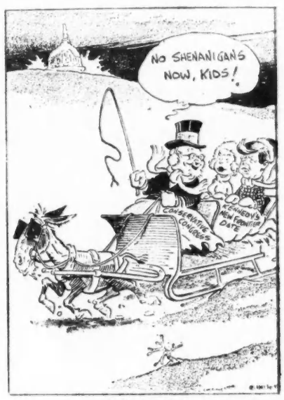
Holland, Chicago Sunday Times Well chaperoned

the Democratic leadership not to seek new civil rights legislation in this Congress was certainly re-enforced in the deals being made to line up Southern votes in the Rules Committee fight. One influential Democrat on the House Labor Committee told this writer that a deal had been made not to seek any pro-labor changes in the Taft-Hartley or Kennedy-Landrum-Griffin laws, and that he believed a similar deal had been made to emasculate proposed Social Security medical care to the aged. If the GOP-Dixiecrat coalition retains its unlimited control of the Rules Committee it is certain to be disastrous for even the mildly liberal proposals given a priority by President Kennedy. If that control shifts to Speaker Rayburn the results are uncertain.