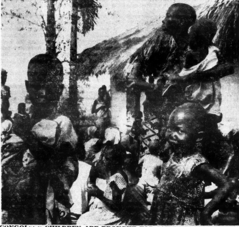
CONGOLESE CHILDREN ARE BROUGHT FOR "AID" TO A UN CENTER But most African leaders think "restitution" would be a better concept

China and Cuba are avowedly socialist; India and Mexico pay at least lip service to socialism as the ultimate destination; and Ghana, while presently following a