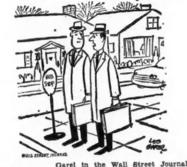
r to live for and none "I have everythin of it paid for!"

Nor does extending the mortgage to 40 years help much. This would merely reduce the total monthly charges by $3.15. OUT OF REACH: The purchaser of a $10,000 house would require a smaller income, $103 a week if he obtained a 35year mortgage or $101 on a 40-year mortgage (see Chart A). This would help some of the "forgotten families" Kennedy referred to. There are, however, very few $10,000 homes available. The National Housing Conference in a recent survey of the lowest-priced homes in 31 cities found that the median home in this category cost $12,300. Homes in this price range are out of the reach of families