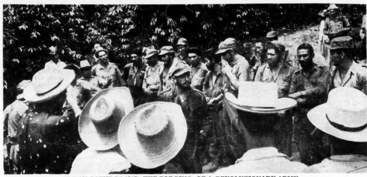
CUBAN SCENE IN 1957: THE FORGING OF A REVOLUTIONARY ARMY

Castro (center, facing camera) swore in a group of recruits at a secret coastal base