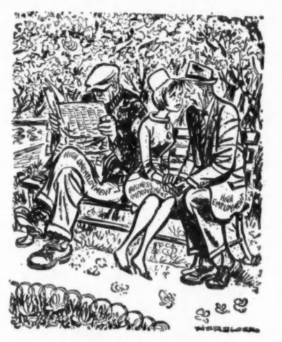
"I was hoping we could get together

Material distributed by the U.S. Dept. of Labor at the recent White House Regional Conferences on Full Employment and Economic Growth confirms the enormous size of the unsolved job problem. In outlining the "Challenge for the