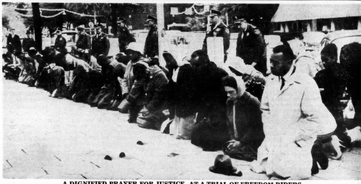
A DIGNIFIED PRAYER FOR JUSTICE AT A TRIAL OF FREEDOM RIDERS In Albany, Ga., the cops just stood by for a time, then made mass arrests of Negroes

that for more than a year had kept from general public knowledge the Western machinations in the Congo. To the Asian-African UN members the O'Brien revelations were no surprise. But the Western press had consistently ignored Asian-African complaints, playing up only Sovietbloc denunciations of the Congo fiasco in an attempt to brand the opposition to the Hammarskjold operation as "a Communist plot to wreck the UN." (Continued on Page 8)