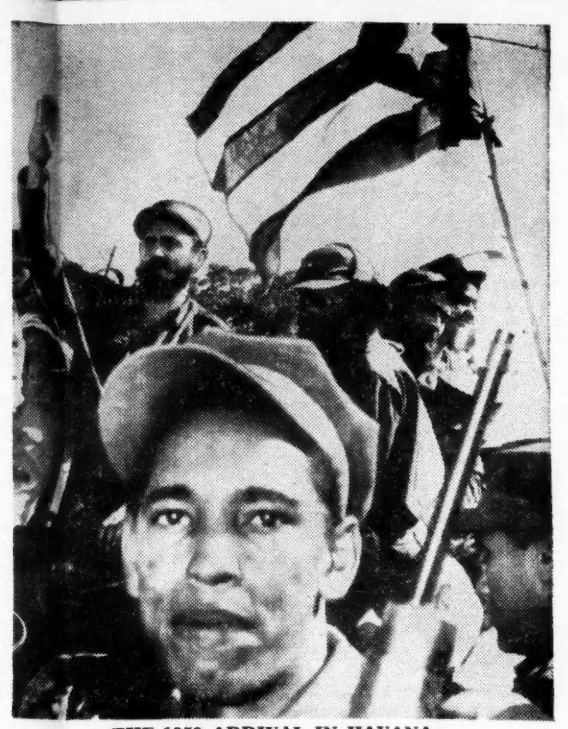
THE 1959 ARRIVAL IN HAVANA The people hailed their hero

the mentality of many of us. Should I be ashamed to confess it? On the contrary, I feel proud that when I left school I knew nothing about politics and now I know something-it shows something has