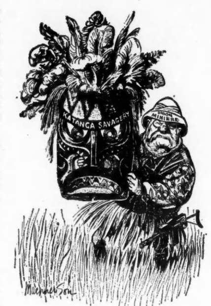
Macpherson in the Toronto Daily Star Behind the mask

UN commanders are convinced that without the military skill of the 200 or more mercenaries, the Tshombe resistance would collapse and negotiations between the province and the Congo could begin. On the need for such negotiations, all governments have become