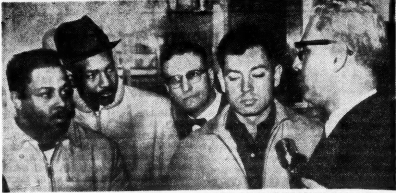
LABOR SECRETARY GOLDBERG (R) VISITS AN UNEMPLOYMENT OFFICE His department's statistics were challenged as minimizing the jobless problem

The current campaign to eliminate the unemployment problem by defining it away was initiated by an article in the