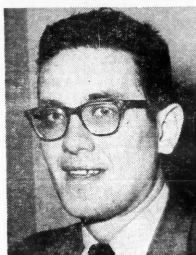
A new round in the courts

Citing the test oath as a historic weapon against religious and political minori-ties, he said: "I think that history shows such test oaths to be one of the most generally and continuously hated and dangerous forms of governmental intrusion upon individual freedom that lib-erty-loving people have had to contend . . . Whether religious, political, or test oaths are implacable foes of free thought. By approving their imposi-tion, this court has injected compromise