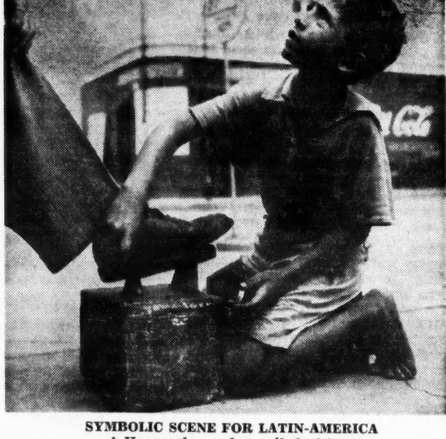
A Venezuelan and a well-shod heel

A Consistent Position to Coexistence & Revolution from P.O. Box 24, Midtown Sta-, N.Y. 18, or at newsstand, S.W. ner 42nd St. & 6th Ave,