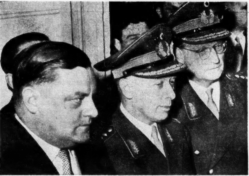
HITLER'S FOLLOWERS—EAGER TO BE HIS SUCCESSORS Defense Minister Strauss and Gens. Heusinger and Speidel

FOR 'BANDITS': An example of this can be seen from the following: In December of 1942, a sector commander of the Wehrmacht asked Heusinger for specific instructions as to what to do with partisans who deserted to the Germans. Here is the text of Heusinger's reply: "Dec. 7, 1942. To Chief of General Staff, Army