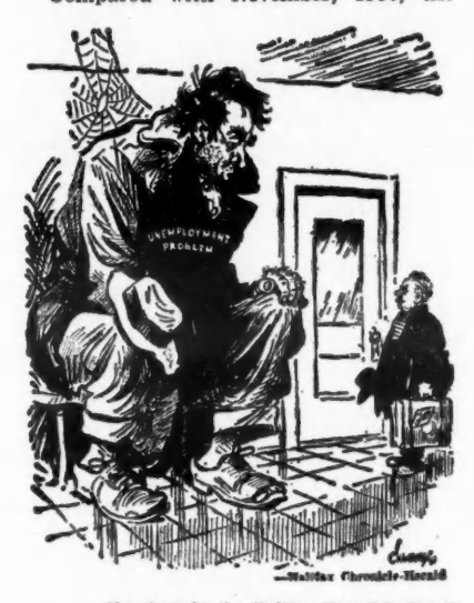
"They said you were out. So I waited."

latest unemployment total and the jobless percentage were unchanged. "Hardcore" long-term unemployment was nearly 40% larger than a year ago, but the number of involuntary part-time workers had fallen. The Administration's optimism rested