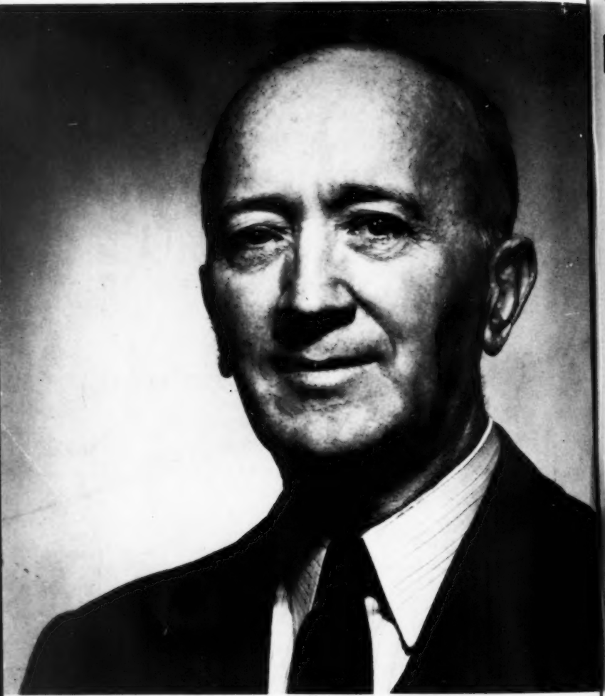
WILLIAM Z. FOSTER

National Chairman Communist Party of the United States