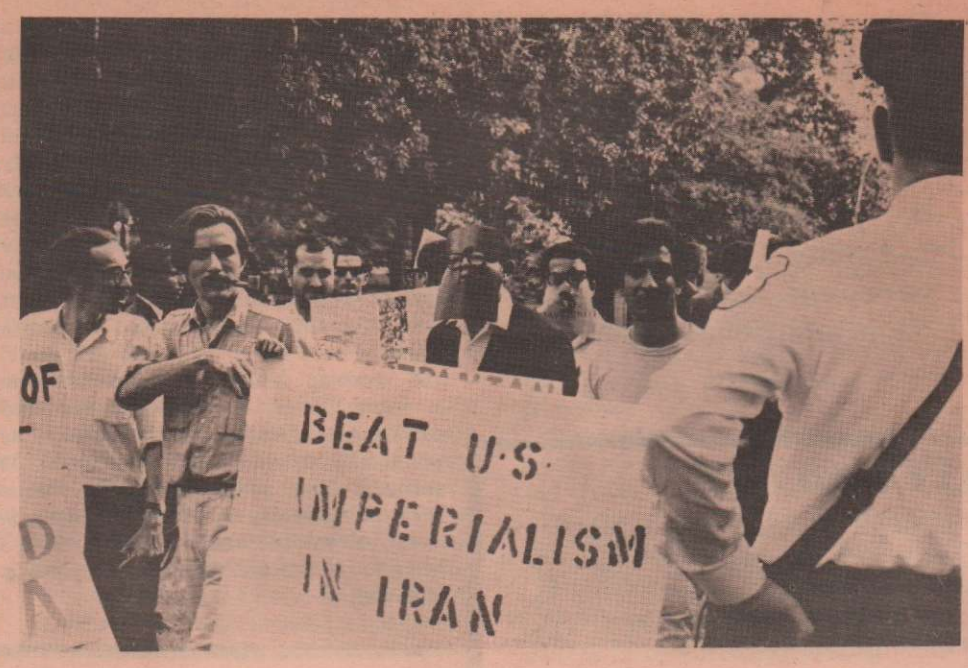
This picture has nothing to do with the story on page 5

There is a vision of a new America emerging among oppressed people of this country, and the vitality of that vision is being sought by young people through music, drugs and a new style of life; that vision will find political realization only when people work from the recognition that politics is part and parcel of their existence, and not just a way of helping people get what we already have. What "solid" middle class America has is diseased and is being abandoned by the young in search of something more complete. SDS is able to do radical organizing only because it grooves, if you will, on that new vision-organizers see their own lives integrally tied to what they are creating as a political reality. And the emergent reality will be one with institutions built on the participation of people, institutions that exist because people believe they are responsive to a new concept of human potential. If NCNP is serious about changing the society and creating new institutions, then it must accept this deepest level of combined commitment to both personal liberation and social change.