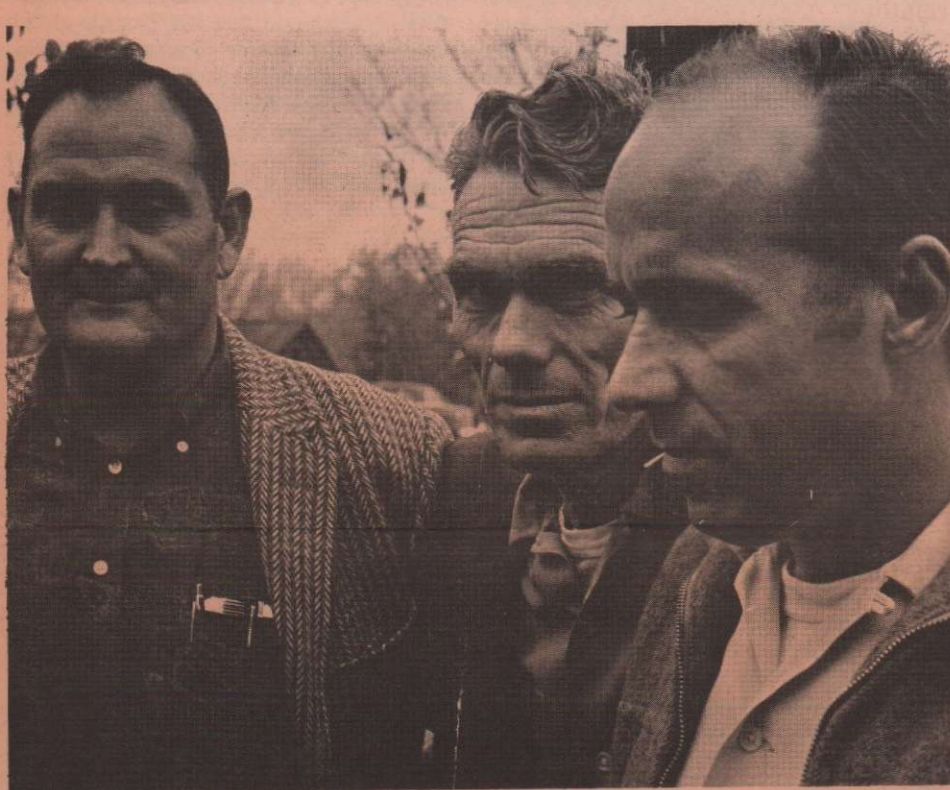
Three of the "criminals"

The Committee for Miners, which was formed to free the miners of their defense burden and to give them aid in their attempt to form a new political movement out of the original picket movement, has worked on the conspiracy case