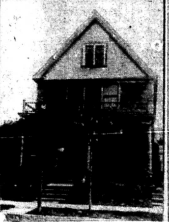
What They Have Done in Working Class Wards