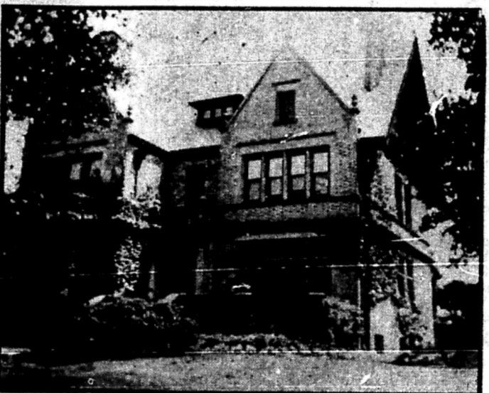
How the Palaces of the Rich Escape

The residence of F. T. Goll, Prospect avenue. Last year, on a 60 per cent basis, it was assessed at $65,680. This year, on a full value basis, at only $67,600! It is worth $100,000. Poor men will have to make up the difference.