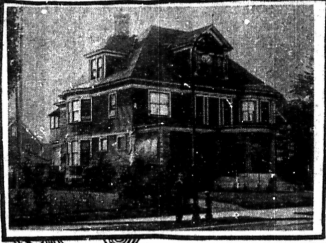
PALACES FOR THE PROFIT TAKERS.

Of course the Tyomies speaks but one language but as the Finns number 50 per cent of the strikers and