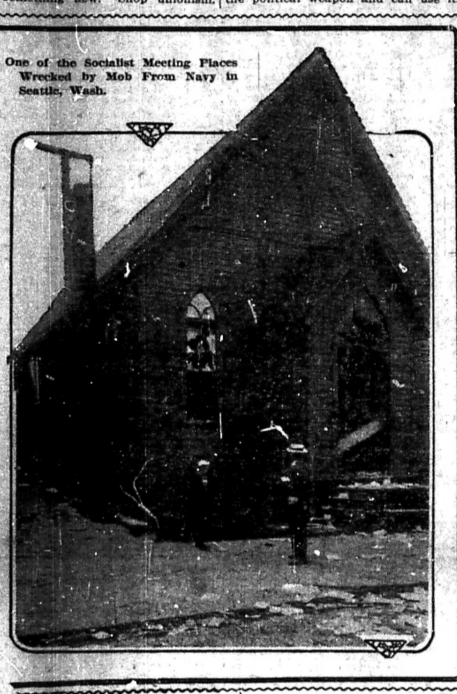
One of the Socialist Meeting Places Wrecked by Mob From Navy in Seattle, Wash.

Furthermore, and this is the essential point: Unionism is for the wage earners. It is an organic growth; it is phase of mass action preceding political action; it is for those who in the economic struggle, not a step ahead for those who have the political weapon and can use it.