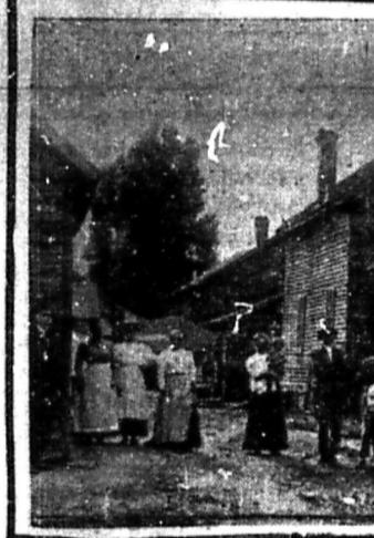
HOVELS FOR THE PROFIT MAKERS.

We have little expectation that the flag issue will be abated because Mr. Berger has spoken so sensibly to the people of Spokane and Seattle. Fighting over the flag serves to obscure the real issue—the exploitation of labor—and, by raising the false issue of love of country, which, in fact, is shared by all, separate the workers over irrelevant issues. It is the old game of divide and conquer.—The Milwaukee Leader.