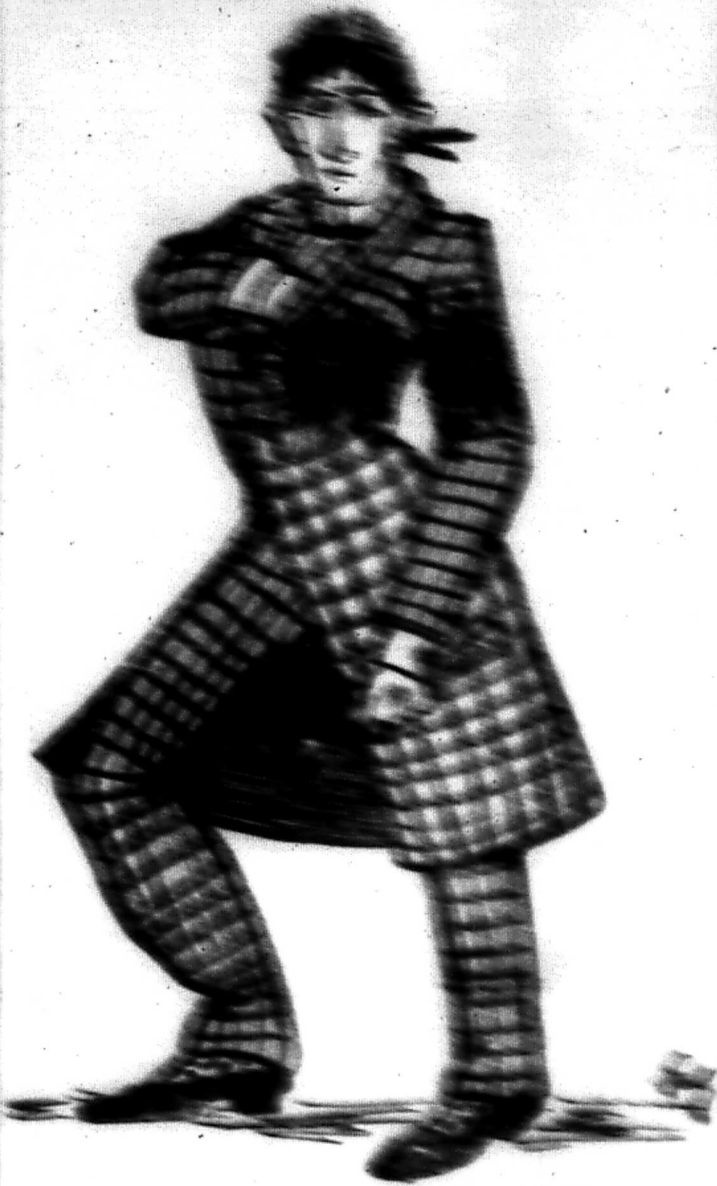
GENERAL SOCIAL SERVICE