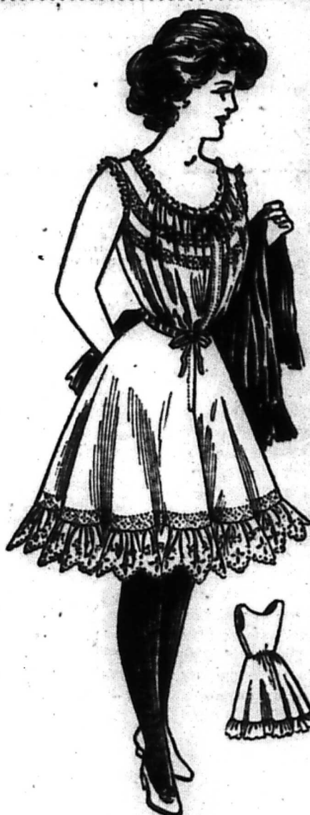
LADIES' COMBINATION UNDERGARMENT.