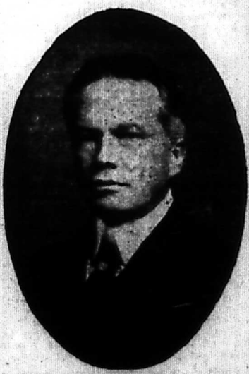
CHARLES EDWARD RUSSELL