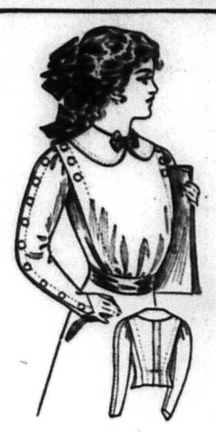
MISSIE'S SHIRTWAIST. Paris Pattern No. 2985. All Seams Allowed.