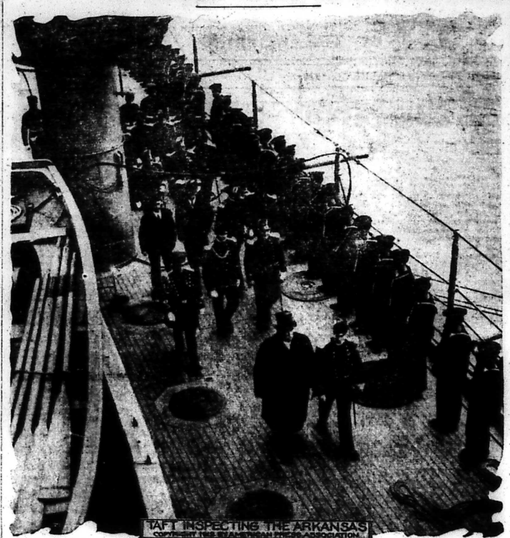
TAFT INSPECTING THE ARKANSAS

After reviewing the fleet in the Hudson President Taft visited the Arkansas, sister ship of the Wyoming and one of the most formidable battleships afloat. The Arkansas is of the super-Dreadnought type and carries the heaviest armor and armament that has ever been placed on a floating fortress. The President spent some time on the vessel, and its main features were pointed out to him.