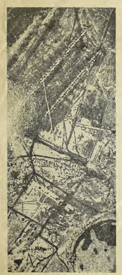
This picture, showing a Soviet military aerodrome, was taken by the camera aboard the American aircraft

If the Security Council—on which pressure will evidently be exerted by the United States—does not take the right decision, we shall raise the matter in the United Nations General Assembly. Such aggressive actions by the United States of America are a very dangerous thing.