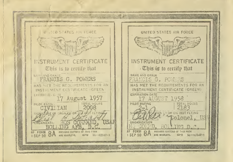
The American pilot carried these certificates, issued by the U.S. Air Force

There was a time-I remember it from young days-when many criminals and other shady elements roamed the world. Those persons resorted to the following