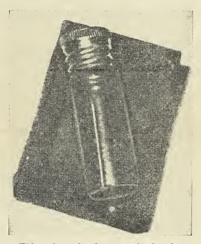
This tiny bottle contained the poisoned needle which Powers carried

Some of you scribble stories against communism through lack of wisdom and under-