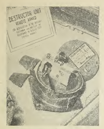
The "destructor unit," which would have destroyed the aircraft if Powers had used his ejector seat. Powers wisely decided to leave the plane by a more difficult but safer method!

the bestial, fear-inspiring face of imperialism. So what? It turns out that this face no longer inspires any fear. Such actions by the United States militarists are prompted, not by the heroism of their master minds, but by cowardice. Danger does not come from someone who has his nerves under control and relies on his powers and possibilities, but from a coward who fears everything.