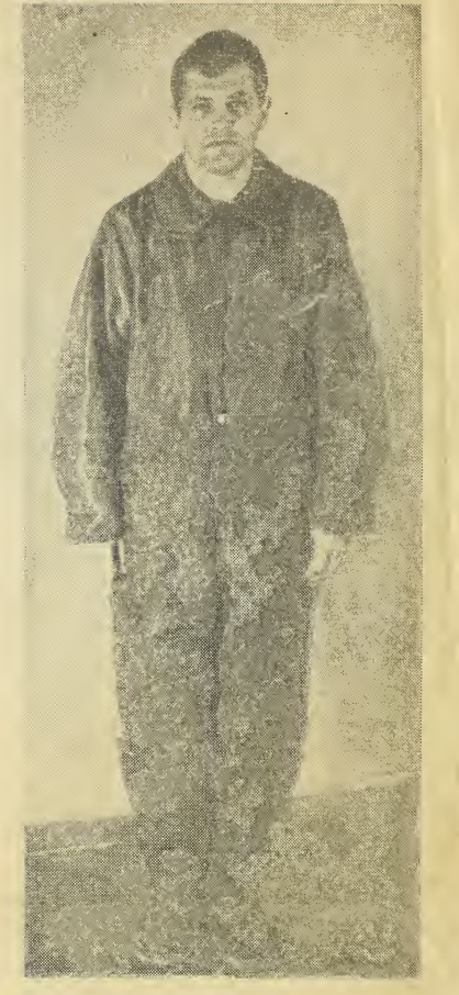
Francis Gary Powers, pilot of the shot-down U-2

KHRUSHCHOV: Well, the statement issued by the U.S. State Department in connection with the intelligence plane naturally alters my belief that the United States