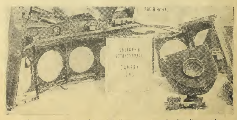
This camera was loaded with enough film to record a strip of territory nearly 2,200 miles long. The lens could be directed through seven different windows in the fuselage, enabling a very wide strip of territory to be covered