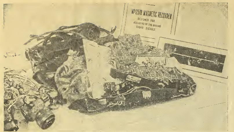
This tape recorder was not in very good condition when recovered—but the recordings it made were clear enough, and they were played over to visitors to the exhibition. They were recordings of ground radar station signals

the President's visit there will be no excesses. Ours are courteous people; they let off steam in words and will leave it to the government to act; they will not indulge in any insulting actions. I think that American journalists and tourists are now aware of the restraint and discipline of Soviet people.