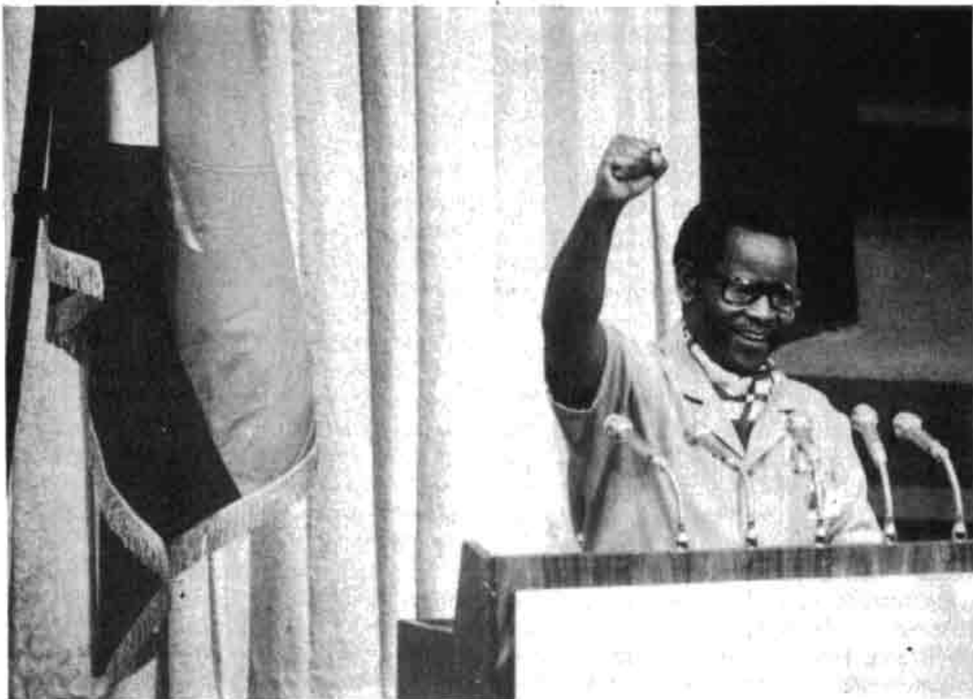
President Oliver Tambo salutes the MPLA Congress in Luanda

More significant in the longer term, the