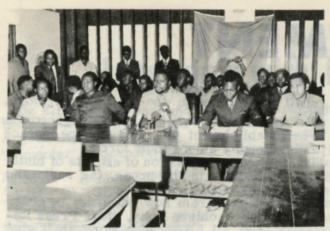
The OAU commission of reconciliation.