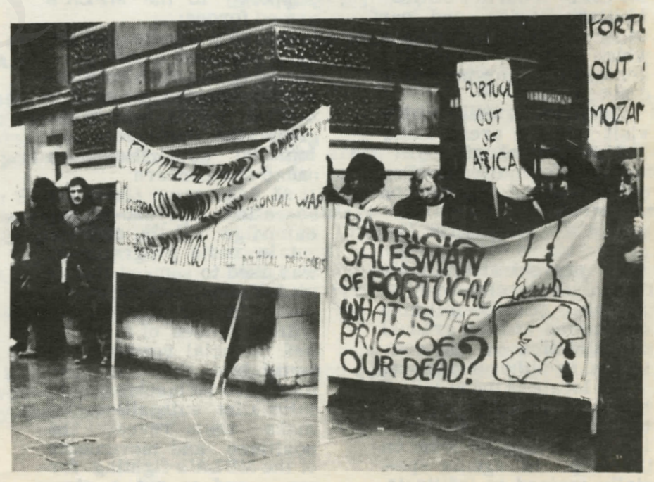
Demonstration outside London Foreign Office.