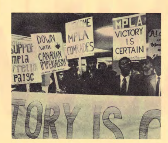
LSM welcomes MPLA Delegation at Vancouver International Airport.

FUNDS RAISED AT THE PROGRAMS will be channeled into support for the Popular Front for the Liberation of Oman and the Arab Gulf (PFLOAG), which is presently fighting the combined forces of reactionary Oman, Iran and Saudi Arabia, backed by British mercenaries and American arms. With the intention of carrying out more information work on the Arab World we have also purchased and shown the film, "We Are the Palestinian People," which though it reflects the views of only one of the Palestine movements, Fatah, and makes no mention of the Marxist PFLP and PDFLP whatsoever contains much useful background material on this struggle.