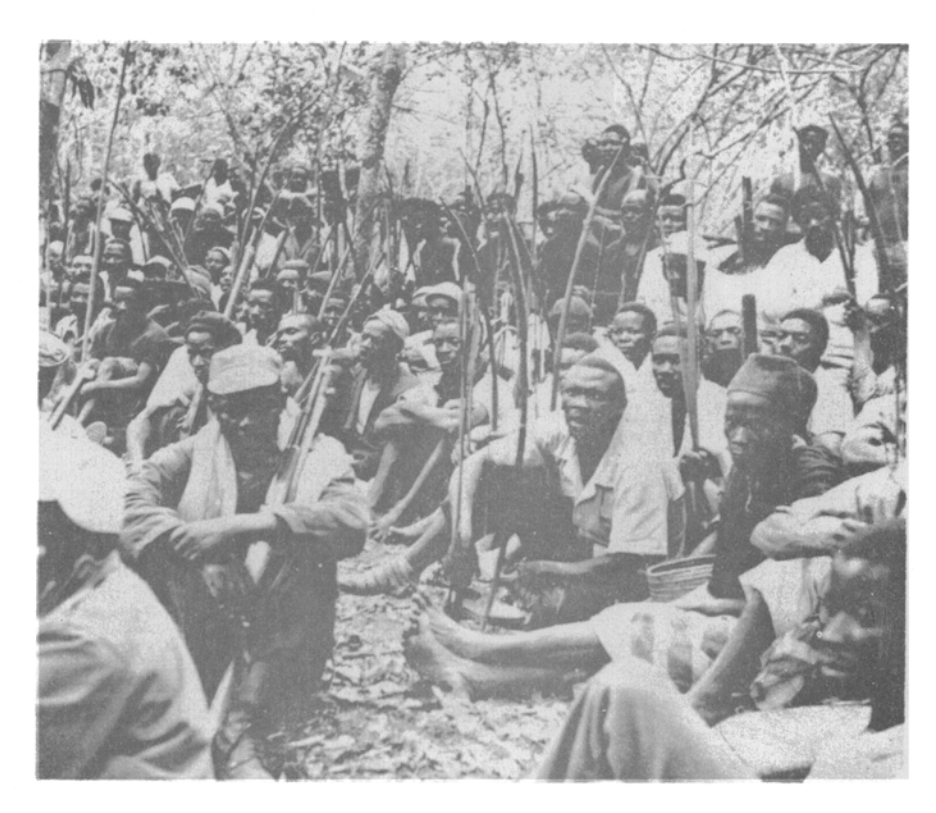
A Public meeting in Free Mozambique.