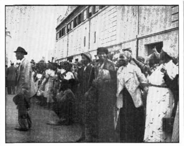
A section of the crowd of women who demonstrated against the pais laws outside the Native Commis-sioner's offices in Durban.