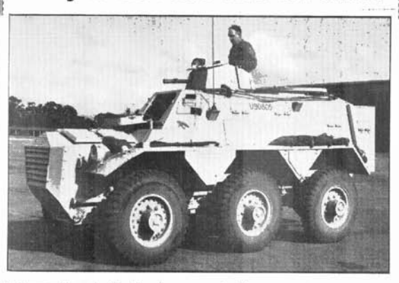
The Government has ordered 80 of these Saracen armoured vehicles at a cost of £1,200,000 to deal with "internal disturbances."