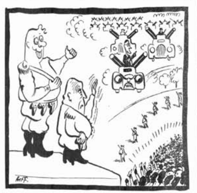
VERWOERD: "These tanks will make them agree with us even more."

Council. A statement issued by the SACPO National Executive this week called upon the Coloured people not to accept this form of "Bantu Authorities" being foisted upon them, nor to offer themselves for election or nomination to the Council.