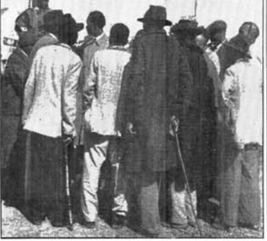
Pondo tribesmen in Bizana discuss events during one of the arson cases held there recently.