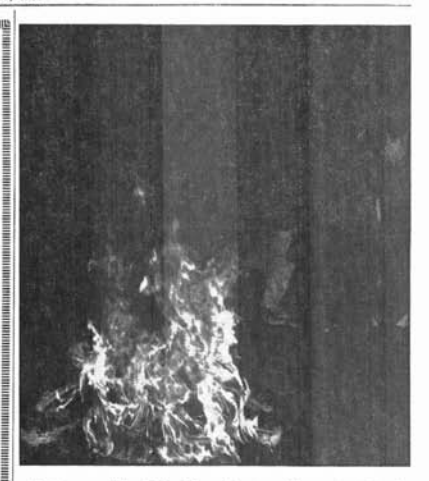
Bonfires were lit in all the Johannesburg townships on the night of Afrika Day. This one in Alexandra Township lasted more than