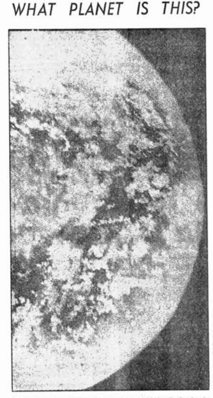
WAS YOUR GUESS RIGHT? It's a picture of Mother Earth taken by Cosmonaut Gherman Titov while on his space trip around the world in the rocket ship Vostok II.

the armonic of the colonian space of the colonians of the colonialists in Portuguese Colonialists in Portuguese Colonialists in Portuguese Guinea was launched last August under the leadership of PAIGC. At that time, a statement was issued saying that in view of the Portuguese Government rejection of the Portuguese Government rejection in the Portuguese Government rejection in the Portuguese Government rejection in the Portuguese Government rejection in the Portuguese Government rejection in the Portuguese Government august 1,1961, the day of transition in our National Revolution from the stage of political struggle to that of autients in surrection and to take forces.