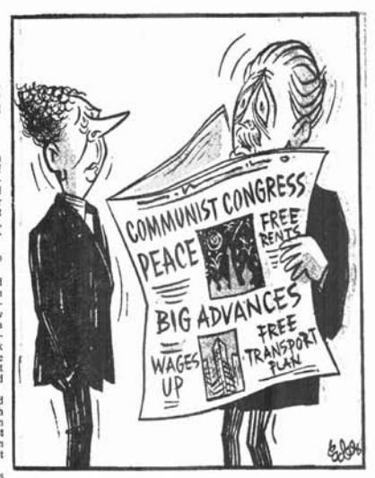
Oh dear, the news from Russia looks bad again!"

Total agricultural output has gone up 43 per cent in the past