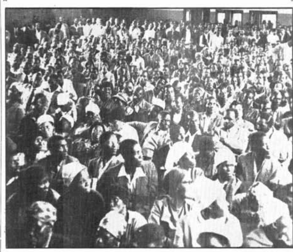
A portion of the large crowd which attended the SACTU conference in Durban last week-was standing room only at the opening of the proceedings. (See story on page 1.)