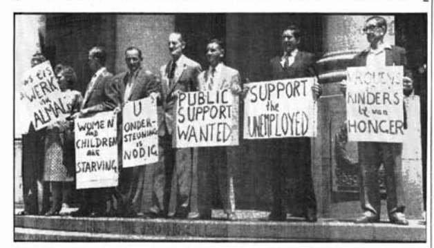
These are some of the unemployed White workers who gave Department of Labour officials a rough time in Johannesburg recenty.