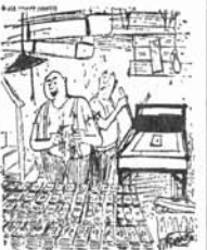
Sketches in the Wall Street Journal: "One million bucks! Where else but in a democracy could it happen to a couple of ordinary guys like you and me?"