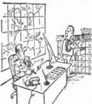
"Are we supposed to have six inter-continental satellites aimed at Moscow, Idaho?"