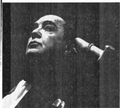
The brilliant and witty Irish actor Michael MacLannair, who has been touring South Africa with 'The Importance of Being Oscar', will not leave the country, he announced, without giving performances to completely non-racial audiences. He will give his two final performances, therefore, in the University Great Hall in Johannesburg on Saturday July 21 at 2.30 p.m. and 8.30 p.m.