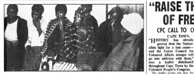
This women's deputation about rents in Jo'burg did not get in to see the manager. The interpreter clerk listened bard, but he has no power.