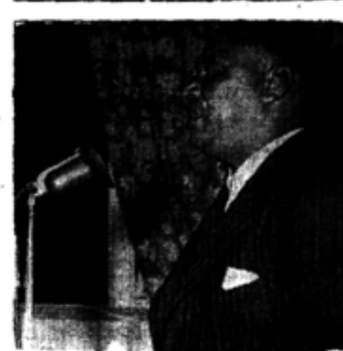
Right: J. B. Marks, Union President at the time of the 1946 miners' strike, and today the ANC's Director of Transport.

Speech Convention decided on a strike throughout the Transvaal Province to protest at the bans imposed on J.B. Marks, Yusuf Dadoo and other leaders. On 1 May 1950, a powerful strike took place in the Transvaal which was the most widespread in the long history of liberatory politics. In Parliament the government introduced the Unlawful Organizations Bill to give it power to proscribe organizations. The African National Congress , the Indian Congress , the Communist Party and the Council of Non-European Trade Unions together organized the first general strike covering the whole country in protest against this law. On 26 June 1950, hundreds of thousands stayed away from work. This was a historic date because it laid the foundations for close co-operation between national liberation and working-class organizations, which was to be a feature of progressive politics in South Africa.