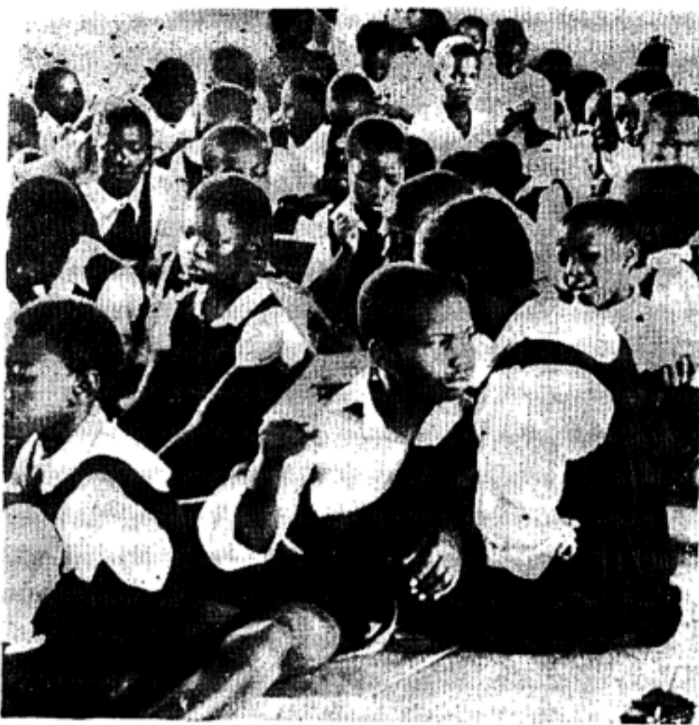
School accomadation: seated on the floor with 50 others.