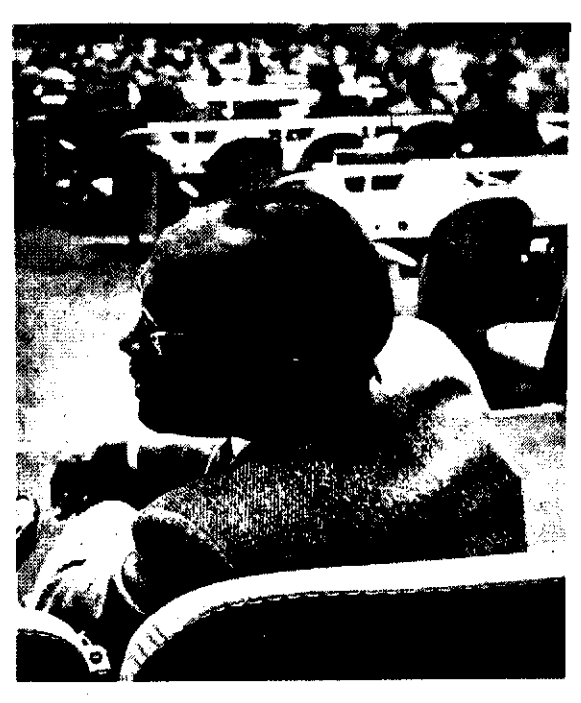
Amilcar Cabral at the United Nations.

At the same time that Cabral was referring to the increasing desertions to the PAIGC of Africans conscripted by the Portuguese, several articles cited the psychological warfare efforts of Antonio Spinola, the Governor-General and Commander in Chief of the Portuguese Armed Forces in Guinea-Bissau. Spinola is trying to "Africanize" the Portuguese troops in Guinea and already has a full battalion of African commandos. (Star [S.A.] 11/11; Revolution Afr. [Algeria] 11/10; Star [Johannesburg] 10/28)