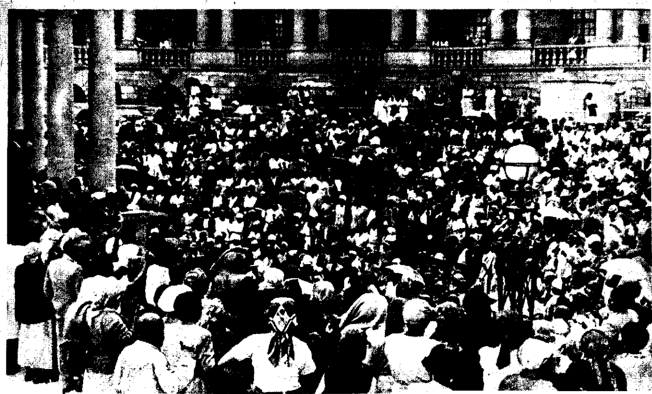
Section of 20 000 women outside Union Buildings in Pretoria

On 26th June, 1955 the Congress Alliance led by the ANC organised a multi-racial Congress which was held in Kliptown near Johannesburg. Other sister organisations were the South African Indian Congress, Coloured People's Congress and the Congress of Democrats (representing progressive whites). The Kliptown Congress adopted for the future democratic South Africa a programme which is known as the "Freedom Charter". This Charter has now become the recognised document of the United Nations "Unit an Apartheid", as it embodies the fundamental human rights as set-out in the U.N. Charter. The fascist Government made every effort to break this historic meeting but failed through the determination of the gathering of the representatives of all racial groups of our country. The year following the adoption of the documents, 156 leaders of all races were arrested and charged with high treason. After four years of triol they were all acquitted. Families were broken and some died during the course of the prolonged trial. June 26 is observed inside and outside our country as South African Freedom Day and is recognised by the U.N. Both in the preparations for the historic Congress and during its deliberations, our women played no small role. They launched a house to house campaign collecting the people's idemands.