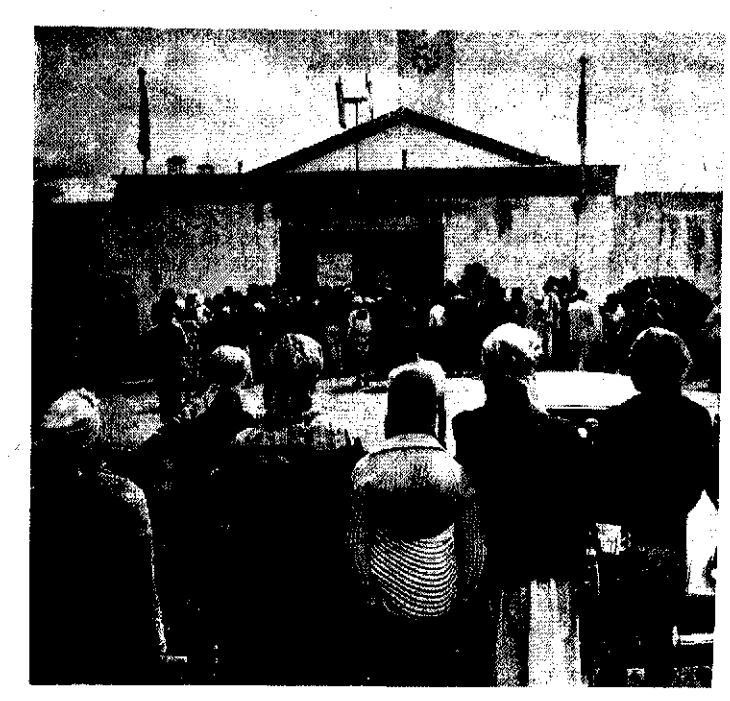
Africans outside a prison in Salisbury

Another white political party has been formed in Salisbury called the Rhodesia Party (RP). The party which apparently has "the support of big business as well as young Europeans" is against African majority rule and what its leaders call "petty racialism." The party hopes to avoid "doctrinaire approaches," and steer a mid-course. "The goal to work towards is freedom of association in the private sphere, and