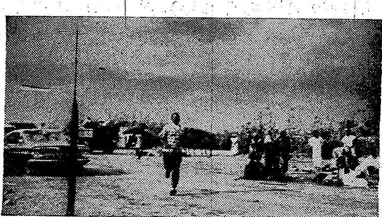
KULUNGUGU. Agents of imperialism attack Kwame Nkrumah with grenades.

getics for colonialism lose their grip on the minds of