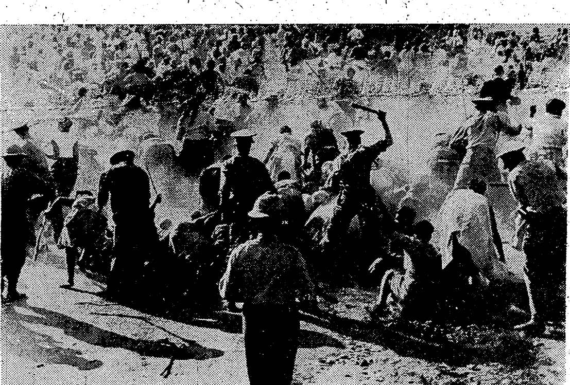
SHARPEVILLE. Colonial police mow down African patriots

from our continent the exploitation of man by man. And we know that the international conditions for the attainment of our objectives are firstly the consolidation and further advance of the world socialist sys-