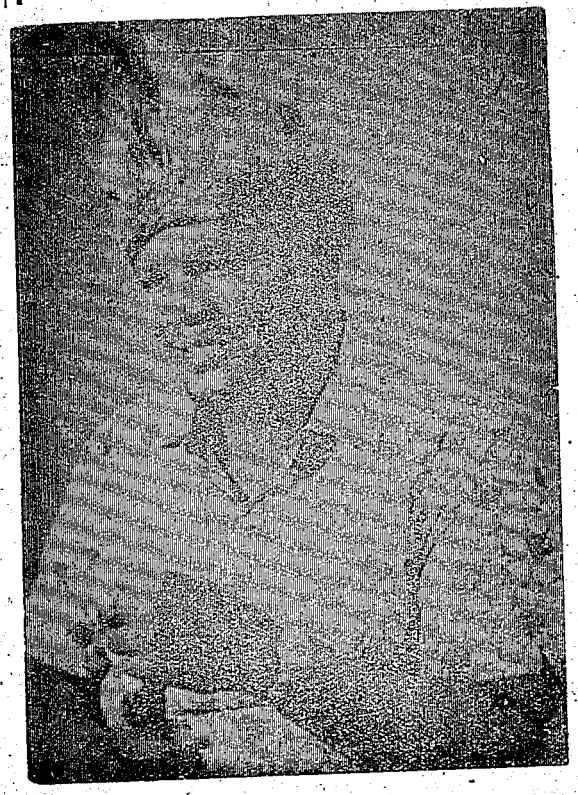
Joshua Nkomo, detained nationalist leader of Zimbabwe.

Memorandum submitted to the British Prime Minister by the Zimbabwe African People's Union (ZAPU)