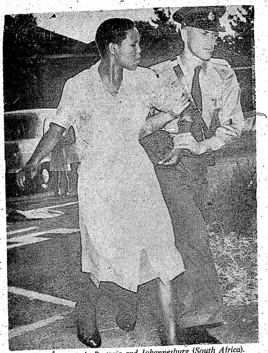
A common scene in Pretoria and Johannesburg (South Africa). Africans are arrested and imprisoned daily by the GESTAPO of nazist Verwoerd.