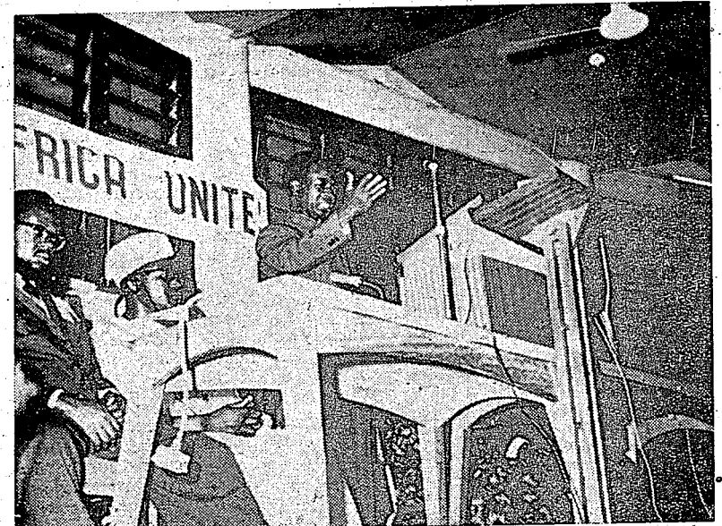
Prestaent Nkrumah of Ghana addresses African nationalists in Accra. He said recently; "neo-colonialism has created a situation in Africa in which the only way to fight and eradicate it is by armed revolution and guerilla struggle

this Constitution as the solvent of a multi-racial society in Southern Rhodesia. The greater majority of the African population rejected it for what it truly is in substance—an instrument for the perpetuation of serfdom. We have no more rights and liberties under this constitution than serfs had in the baronial society of the middle ages.