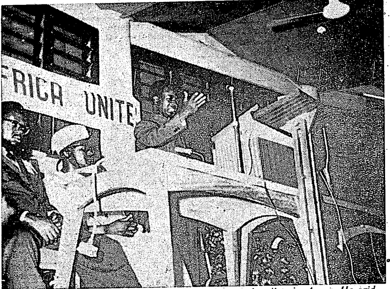
Prestaent Nkrumah of Ghana addresses African nationalists in Accra. He said recently: "neo-colonialism has created a situation in Africa in which the only way to fight and eradicate it is by armed revolution and guerilla struggle

this Constitution as the solvent of a multi-racial society in Southern Rhodesia. The greater majority of the African population rejected it for what it truly is in substance—an instrument for the perpetuation of serfdom. We have no more rights and liberties under this constitution than serfs had in the baronial society of the middle ages.