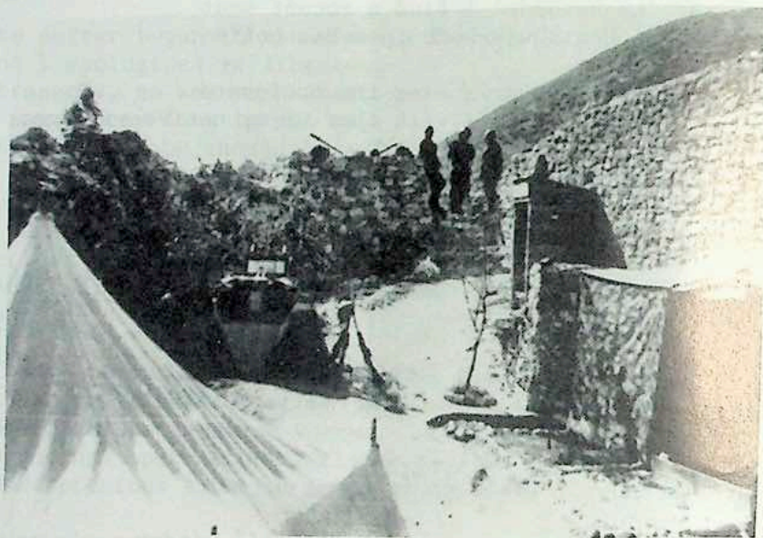
Part of the Italian camp at Berat, 1940

There Hemingway has written not a single word, but Homer in his rags still walks your paths.