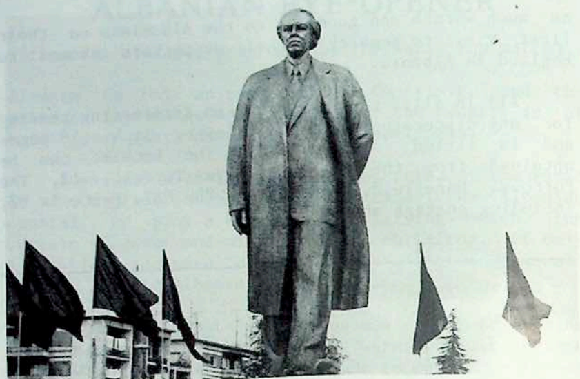
Statue of Enver Hoxha, Tirana