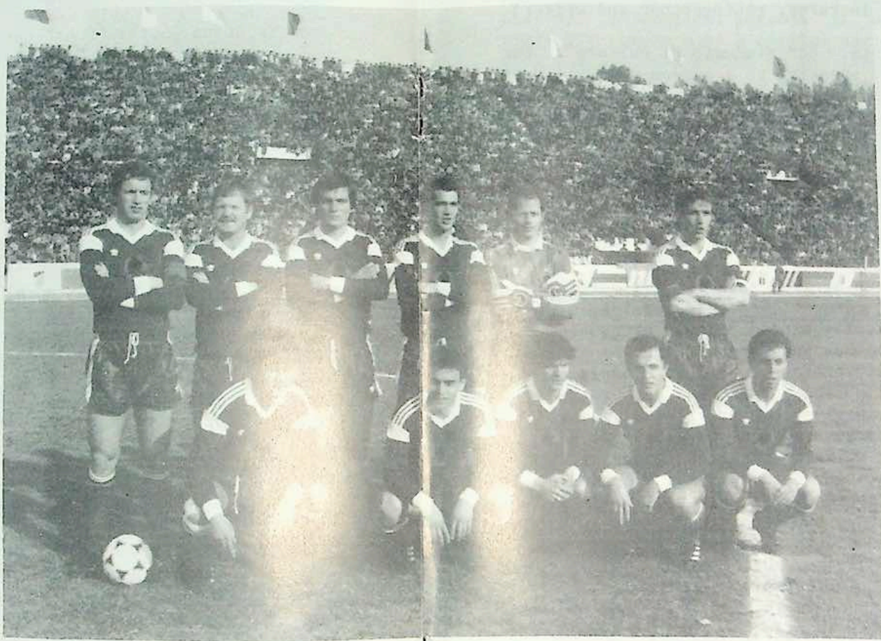
The Albanian National Football Team, 1990