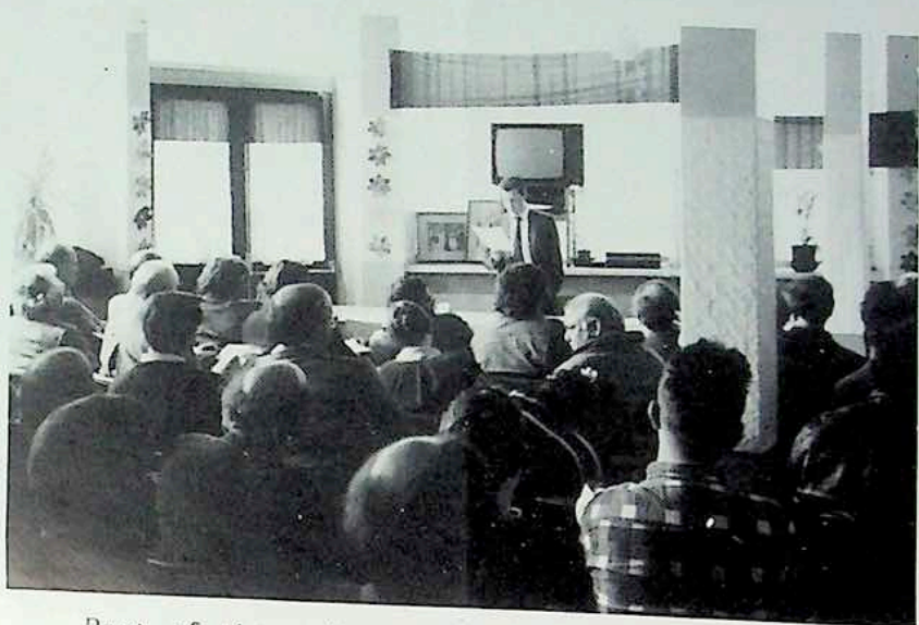
Part of the audience at the Albanian Society's London meeting on 23 April 1989.