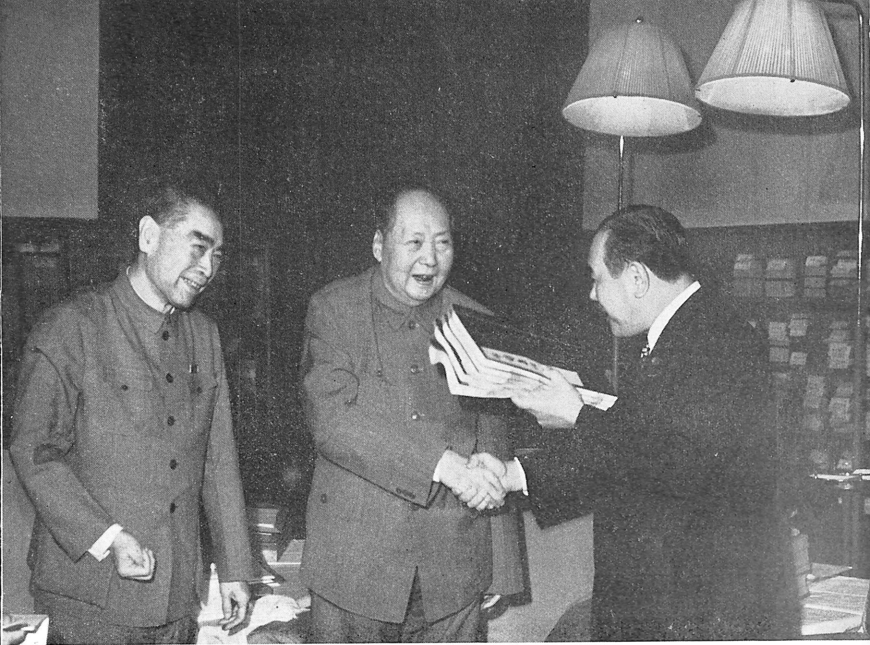
Chairman Mao Tsetung met Prime Minister of Japan Kakuei Tanaka on the evening of September 27, 1972. At the end of the meeting Chairman Mao presented Prime Minister Tanaka with Annotated Chu Tzu .