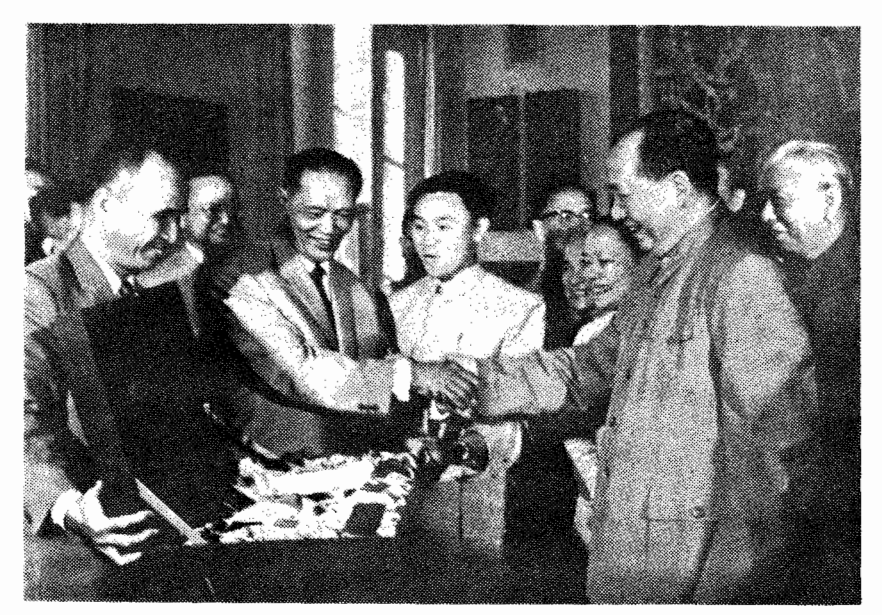
Vice-Chairman Hoang Van Hoan presents Chairman Mao with parts of the wreckage of a U.S. plane shot down over Viet Nam

On July 15, Peking was the scene of a mass rally to welcome the Vietnamese delegation which was led by Hoang Van Hoan, Vice-Chairman of the National Assembly's Standing Committee. Among the 16,000 in attendance was Chu Teh, Chairman of the Standing Committee of the National People's Congress, at whose invitation the Vietnamese delegation had come to China. Both Peng Chen and Hoang Van Hoan addressed the rally. (For full texts of the speeches see pp. 6-11.)