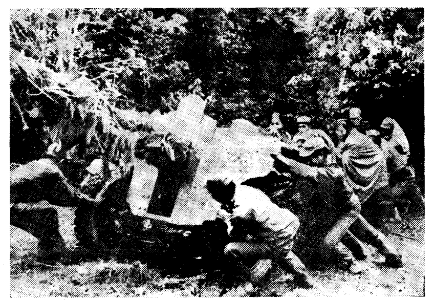
Patriotic armymen and people of Laos moving an artillery piece to the battlefront.

From late March to the end of May, the Cambodian people and their National Liberation Army wiped out, heavily trounced or disbanded two enemy brigades and 56 enemy battalions. They wiped out or captured a total of nearly 40,000 enemy troops, including more than 12,000 U.S. and Saigon puppet troops. They killed a Saigon puppet lieutenant-general and wounded a U.S. colonel.