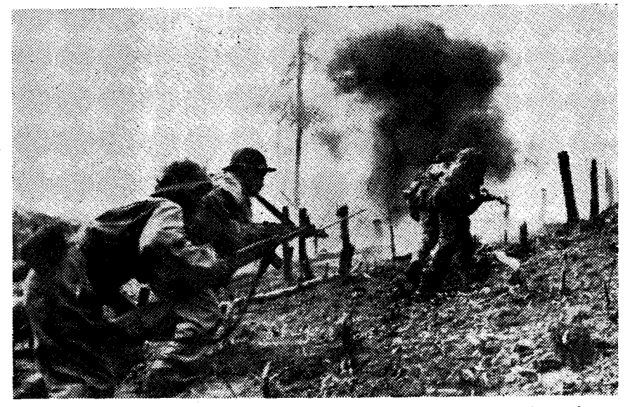
Fighters of the South Viet Nam Liberation Armed Forces rout and pursue U.S. marines.

The Cambodian people's struggle against the U.S. aggressors and the Lon Nol-Sirik Matak lackey clique has gained swift progress in all fields. In the past two months and more, the Khmer people of various strata, under the leadership of Head of State Samdech Norodom Sihanouk and the National United Front of Kampuchea, have strengthened their unity and, together with their National Liberation Army, heroically fought the enemy in defiance of sacrifices and hardships, dealing fatal blows at the reactionary regime and troops of the Lon Nol-Sirik Matak clique and inflicting heavy losses on the invading U.S. aggressor and Saigon puppet troops.