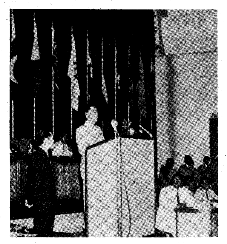
Premier Chou making a speech at the First Asian-African Conference in Bandung.

from an operation and there was a grave threat to his safety just after U.S.-Chiang secret agents had engineered the blowing up of the airliner Kashmir Princess. * The convocation of the conference was of great historic significance because it was the first time that the Asian and African countries, eager to grasp their destiny in their own hands, held such a conference as their own masters without participation by colonial powers. It reflected the common aspirations and demand for unity against imperialism