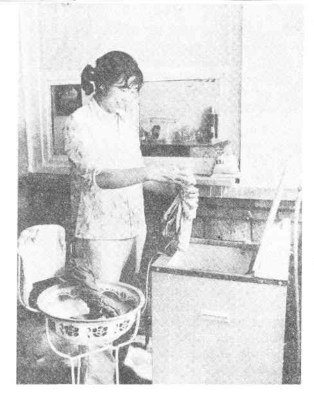
Washing machine in a peasant household makes chores

In 1981, a total of 8.2 million people were given jobs, including young people waiting for jobs in cities and towns, other categories of people and the year's graduates from colleges and secondary technical schools who are covered by the state job assignment programme. By the end of the year, the number of workers and staff members in state-run and urban collective units came to 109.4 million, this being 4.96 million more than it was a year before. Of these, 83.72 million were in state-run establishments, 3.53 million more than the previous