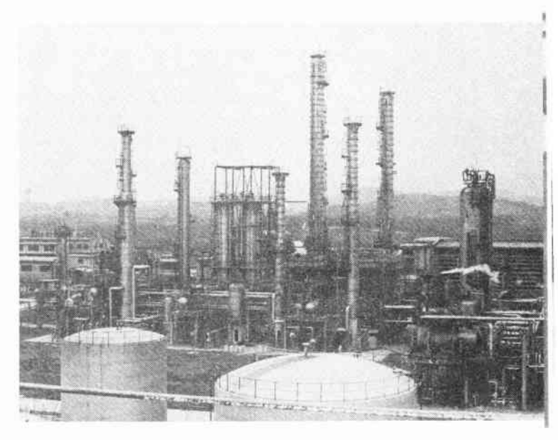
The Nanjing Alkyl Benzene Plant was recently completed and put into operation.

The investment orientation was readjusted in 1981. Of the total investment in capital construction, investment for productive use was 25,200 million yuan, and the proportion dropped from 66.3 per cent in 1980 to 58.9 per cent. The investment in non-productive construction to meet the needs of the people's material and