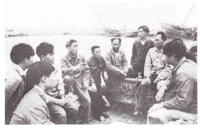
Fishermen of the Changhu brigade, Guangdong Province, discuss how to combat smuggling.

Union adopted such an economic policy. Lenin pointed out that the policy benefited the Soviet economy, but he also warned the Soviet people that it would bring corrosive capitalist malpractices, and called on the Communists to use communist ideology to counteract them.