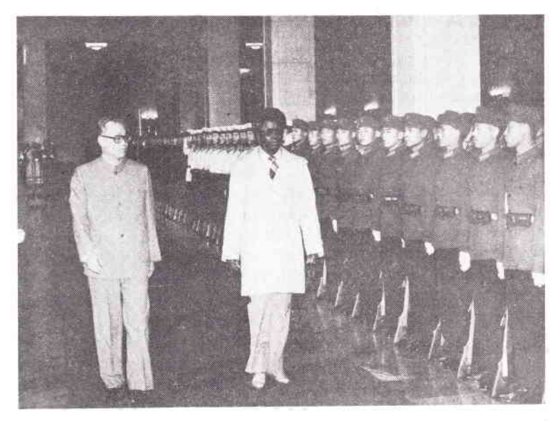
Samuel Kanyon Doe, accompanied by Premier Zhao, reviews a guard of honour composed of the three services of the Chinese People's Liberation Army.

Zhao Ziyang reiterated that the strengthening of unity and co-operation with third world countries is a basic principle of China's foreign policy. He expressed support for the just struggle of the other third world countries against imperialism, colonialism, hegemonism and racial discrimination as well as their struggle to establish a new and reason-