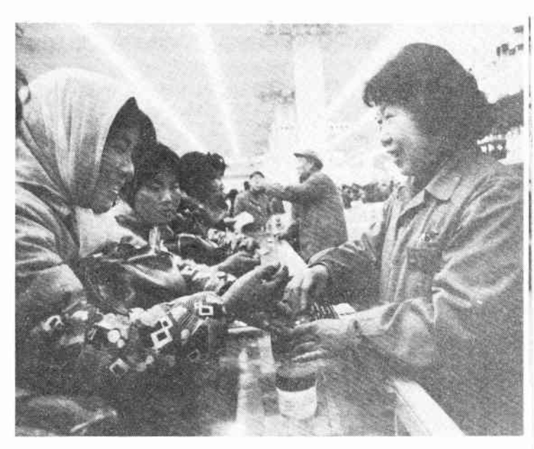
Bustle of activity at the Beijing Department Store.

The government again raised the state purchasing prices of some farm produce in 1981, including soybeans, tobacco and vegetables. In addition, more farm produce was purchased at negotiated prices and at prices for the surplus above purchase quota. As a result, the total