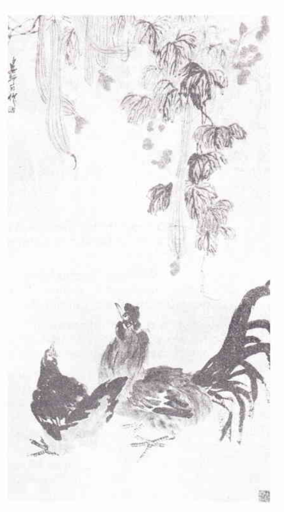
Staring at the Disheloth Gourds.