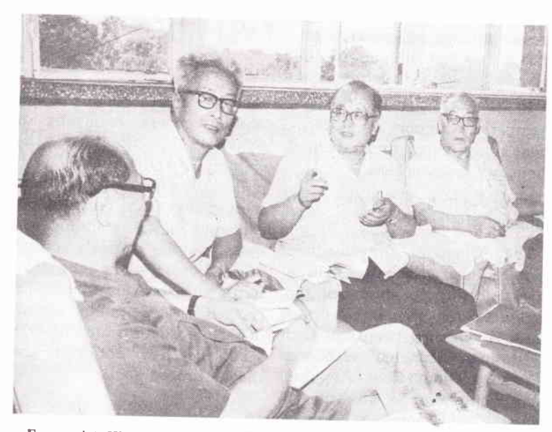
Economist Wang Guangying (second from the right) is now deputy mayor of the port city of Tianjin.

Many technical specialists and experts were persecuted as "reactionary bourgeois authorities" during the "cultural revolution" (1966-76). Following the downfall of the gang of four in 1976 and the Third Plenary Session of the 11th Party Central Committee in December 1978. the authorities took measures to rectify the damage done by such "Left" deviationist errors