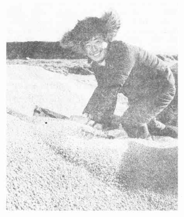
Binxian County, Heilongjiang Province, reaped a bountiful harvest last year and delivered and sold 50,000 tons of soybeans to the state.

for production. Total value of agricultural output, calculated at 1980 constant prices, was 231,200 million yuan, 1.8 per cent above the 1981 annual plan and 5.7 per cent over the 1980 figure.3 Of this, the total output value of farm crops was 148,900 million yuan, 5.3 per cent over 1980; the corresponding figure for forestry was 9,500 million yuan, up 4 per cent; for animal husbandry and fishery, 39,700 million yuan, up 6 per cent; and for rural sideline production, 33,100 million yuan, up 6.8 per cent (of this, the total value of output of industries run by production brigades and teams was 27,800 million yuan, 9.3 per cent over 1980). As regards the output of the eight major farm products, the total output of grain exceeded that of 1980, sharp increases were again registered in the output of cotton and oil-bearing