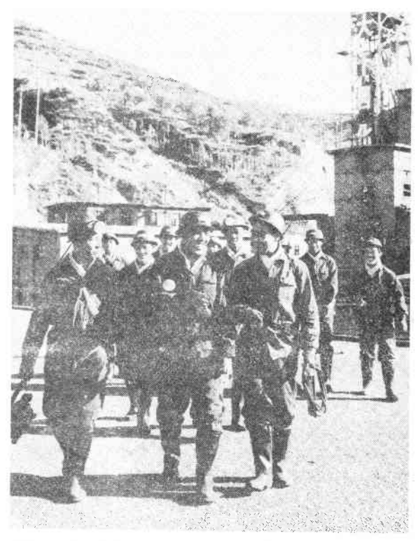
This coal-mining team of Datong, Shanxi Province, fulfilled its 1981 quota 126 days ahead of schedule.

With the further readjustment of the internal structures of industry and active expansion of the production of daily-use consumer goods, light industrial production continued to maintain a fairly high rate of growth in 1981. Total annual light industrial output value, calculated at 1980 constant prices, was 266,300 million yuan, 14.1 per cent over 1980. The proportion of the output value of light industry in total industrial output value increased from 46.9 per cent in 1980 to 51.4 per cent in 1981. Output targets were reached or surpassed for 31 of the 35 major light industrial products which are under state plan, and the output of