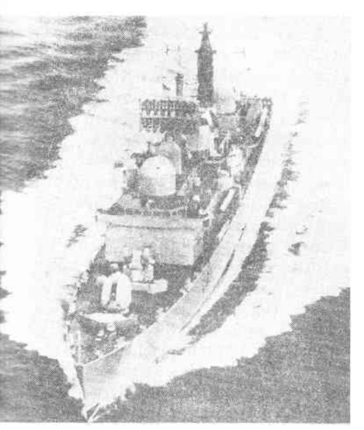
The destroyer "Sheffield" sunk by Argentina,

Observers believe tremendous pressure was exerted on Britain's Conservative government from abroad and at home after the April 2 occupation of the Malvinas by Argentina. It is being called the worst crisis since Margaret Thatcher's government came to power. The British Government has declared a policy of "fruitful negotiations through stepped-up military pressure." It continues to insist that Argentina unconditionally withdraw all troops before negotiations begin. Moreover, it has sent almost two-thirds its naval force to the South Atlantic, oc-