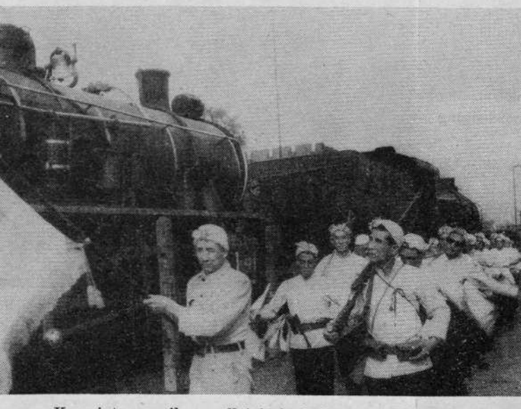
Kuomintang railway officials had thrown this locomotive on the scrap-heap. Liberated workers put it back into running order. There they are dancing the Yangko beside the train.