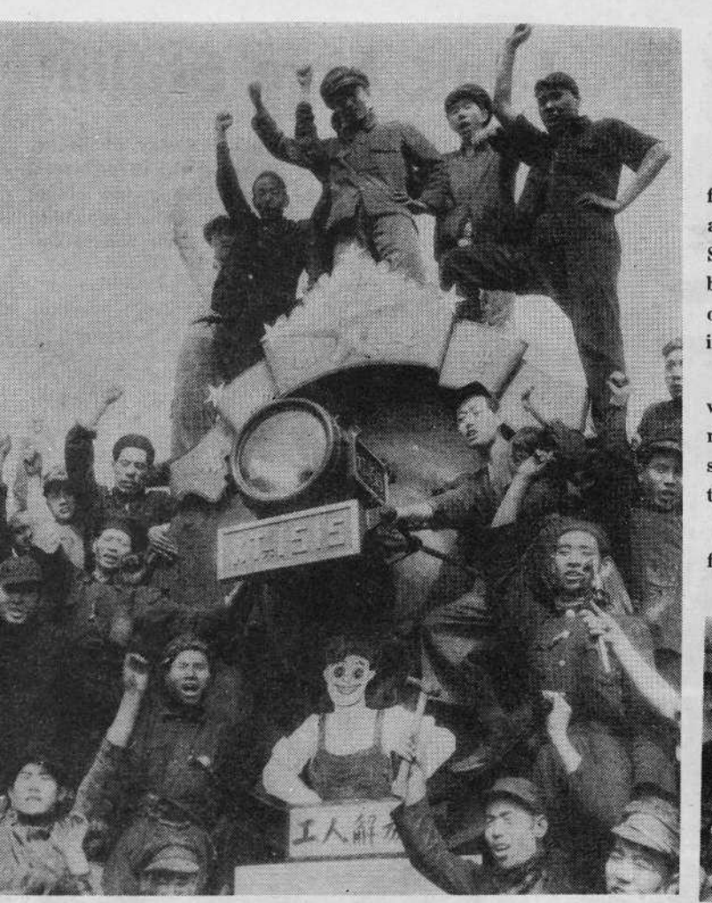
Peking railway workers celebrating first May Day after liberation. The Chinese characters on the front of the engine read: "The workers are liberated."