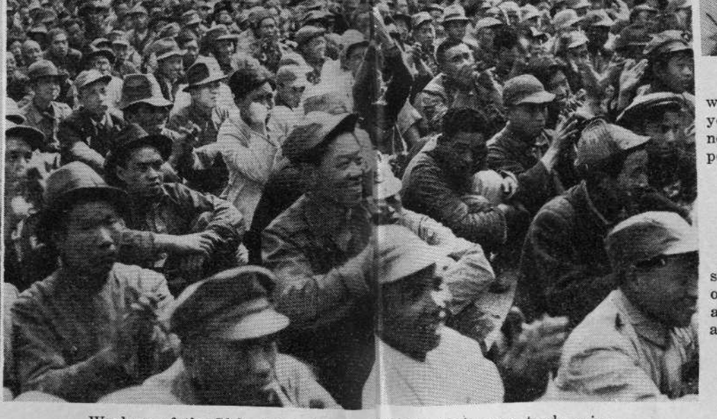
Workers of the 70th Arsenal meet tstablish their own trade union.