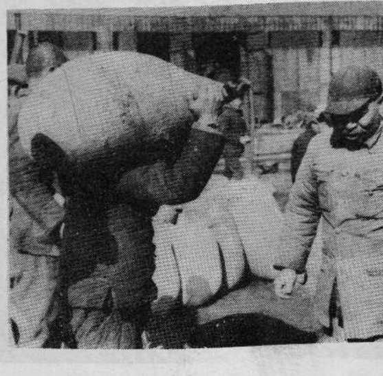
Right: The days of semi-starvation a r e over. Sacks of grain are issued on pay day as part of wages.