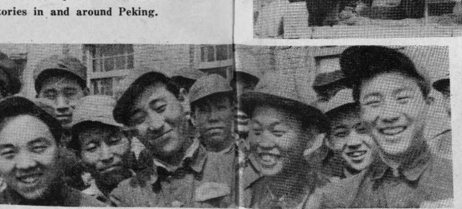
The trade unions have organized all kipf educational, cultural and recreational activities for the workers in every factory. The some workers of the 70th Arsenal are watching a dance performance in the fory yard.

Having attained their new status, the Cse workers are cheerfully and confidently tackling ir new task — to restore and step up production state-owned and private factories alike, labounthusiasm has climbed to a peak never reached be. Here are pictures of workers in some de factories in and around Peking.