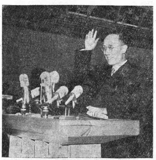
Kuo Mo-jo, head of the Chinese Delegation, addressing the Second World Peace Congress.

Thus, if you are speaking of the defence of peace and security, they also speak of the "defence of peace and security." If you are speaking of fighting for freedom and democracy, they also speak of "fighting for freedom and democracy," and in so