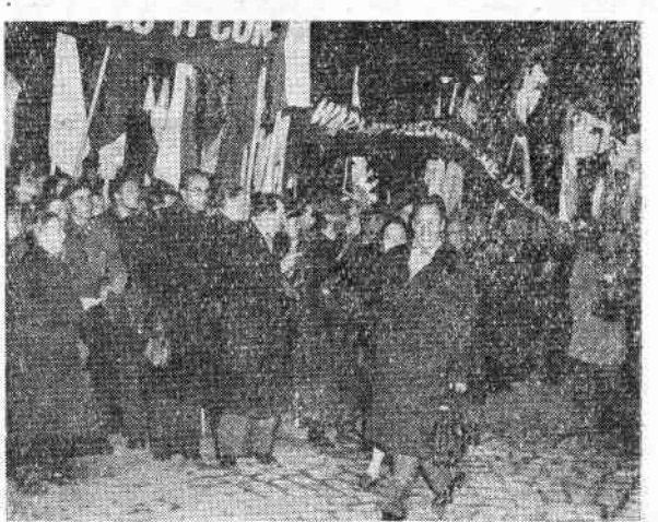
The Polish people welcome the Chinese peace delegates at Warsaw's railway station. In the foreground is Liu Ning-yi.