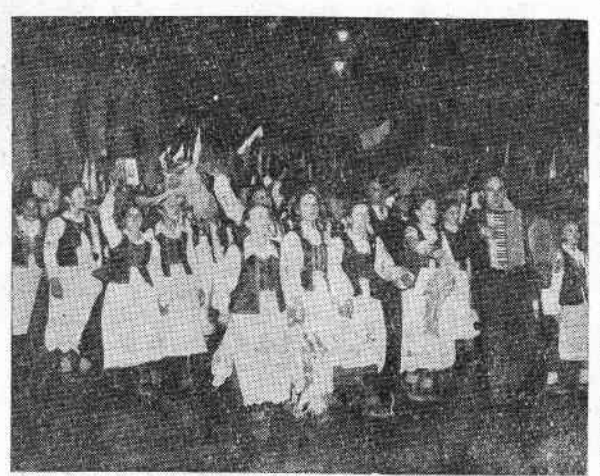
Warsaw's people greet the peace delegates outside the meeting hall of the Second World Peace Congress.

Having received their share of land, our peasants are working hard on their own land, building up the irrigation systems, improving seeds, ploughing deeply, wasting not a single furrow. As a result, we have good harvests throughout the country. Thanks to the efforts of our labouring people, not only have we thoroughly solved the raw material supply problem of industry but also the problem of food and clothing supply as well. We have, moreover, achieved a surplus.