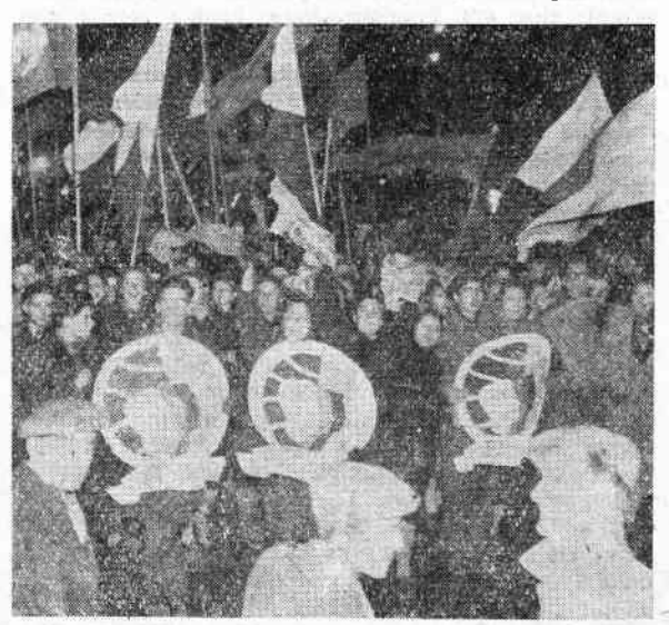
Part of the great crowd greeting the peace delegates outside the Dom Slova Polskiego:

With the same enthusiasm with which the Polish workers helped and supported the meeting of the