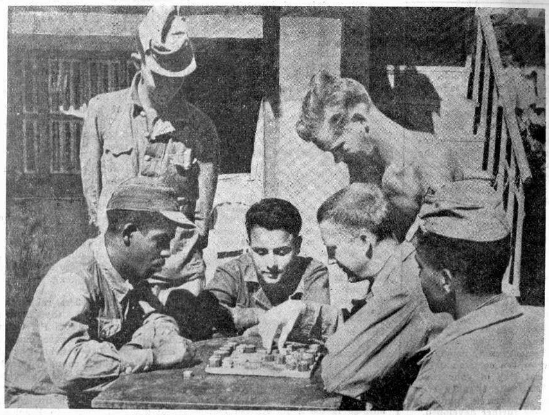
P.O.W's at a prisoner-of-war camp in Korea while away leisure hours with a game of chequers