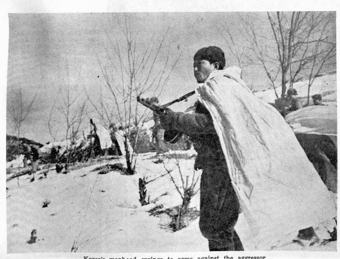
Korea's manhood springs to arms against the aggressor