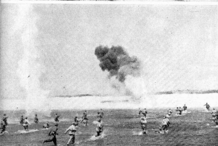
Neither rivers, nor mountains, nor enemy arms can stop the advance