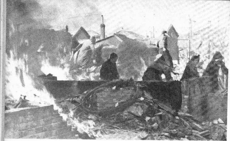
The U.S. aggressors carry their indiscriminate bombing to the Yalu and beyond into Chinese territory