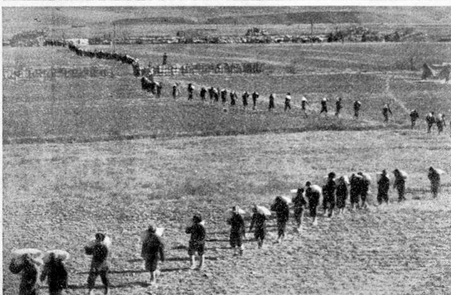
The U.S. imperialists are powerless to stop the movement of supplies to the front