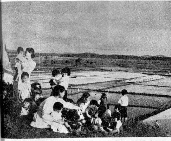
The children of new Korea look out on a peaceful, blossoming land