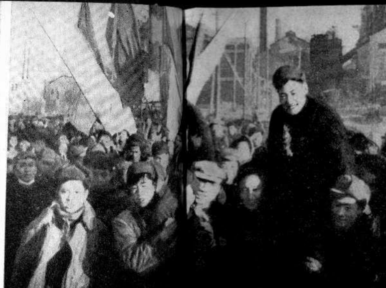
The Chinese people volunter accusands to aid Korea and repel the aggressor. Shihchingsharkers give a rousing send-off to their comrateve volunteered