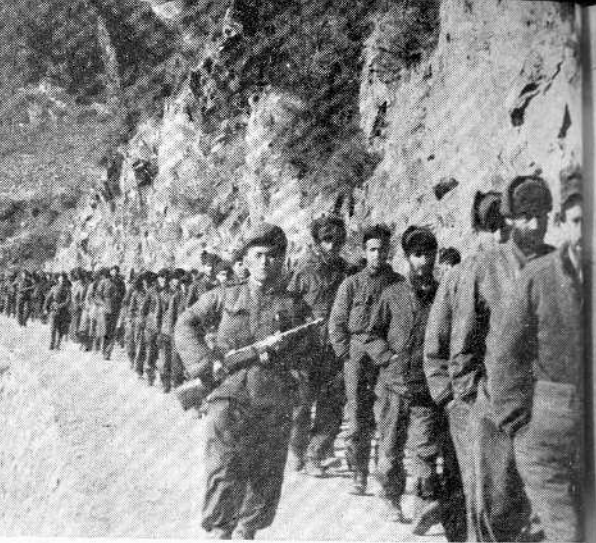
Long lines of captured invaders are taken to the rea