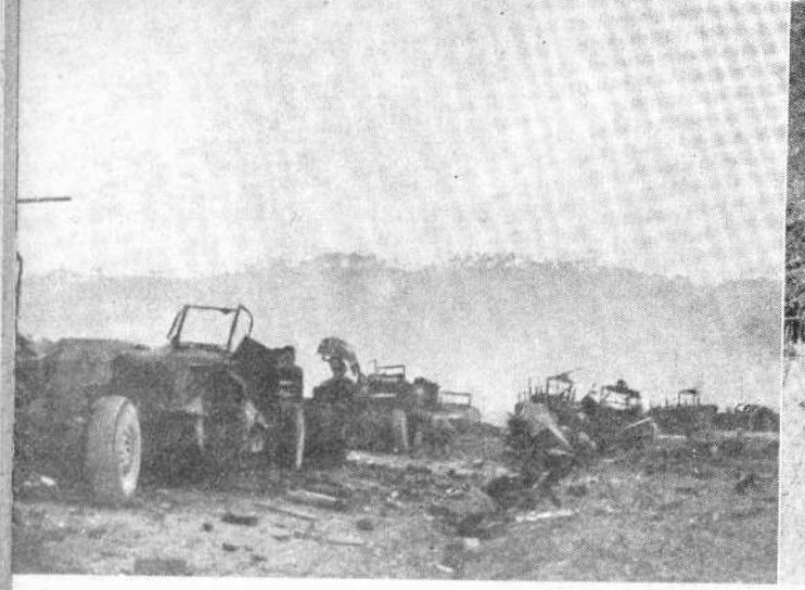
An enemy armoured column, wrecked in the Yunshan campaign that threw the invaders back from the Yalu