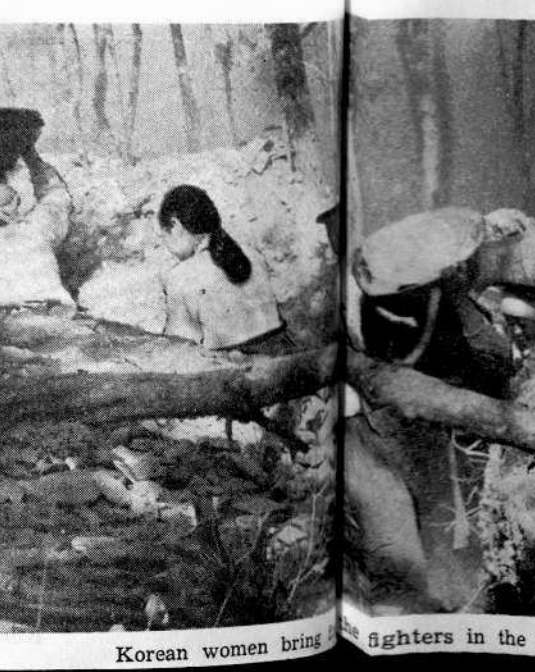
fighters in the trenches