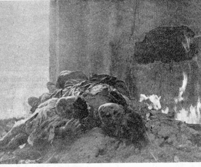
Peace is shattered by American bombs