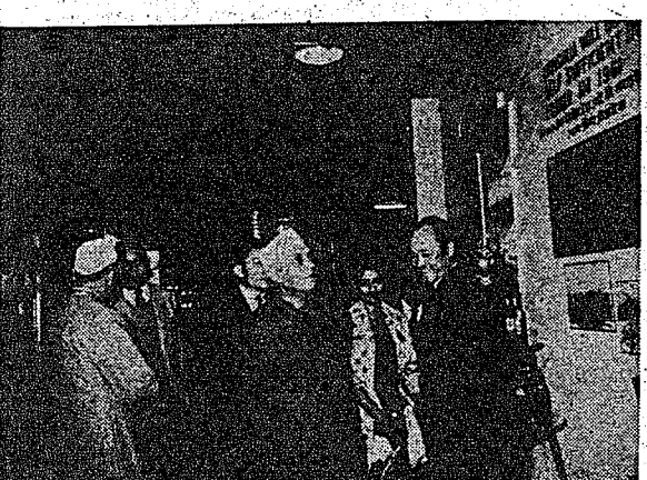
Prime Minister Nehru at the Mongolian Pavilion at the World Agricultural Exhibition, Delhi.

BUDDHISM which originated for India penetrated into Mongolia in very early times and later Indian architectural art found its way to that country.