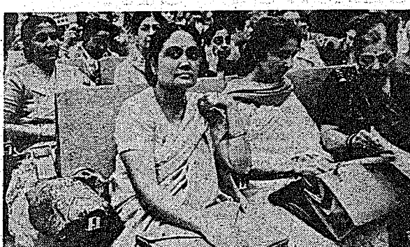
A section of the Indian delegation at the Congress

T was more representative its main documents. than the United Nations with 113 countries participathundreds of millions of women of all lands adopted an appeal to the women of the world which will serve as a clarion call for the mobilisation of the widest possible masses for the solution of problems of life and death that face humanity today.