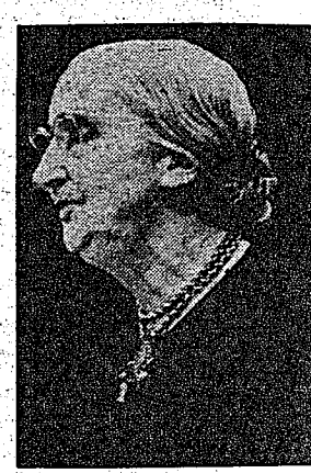
Eugenee Cotton Re-elected President of WIDE

mies. They actually opposed the main line of the whole proand final rejection of the appeal of the Congress made it clear to all that their differ-