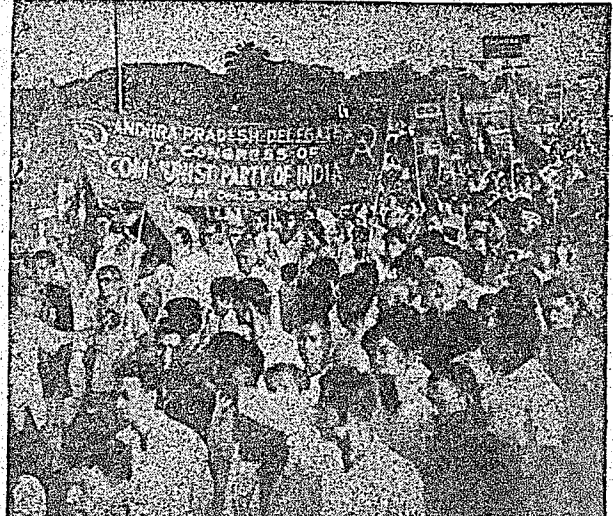
A view of Party Congress Rally.

We also appeal to the governments of Indonesia and Malaysia to settle their differences peacefully, round a conference table, as the growing conflict between these two neighbours intensifies tension in this area and opens the gates for foreign and imperialist in-