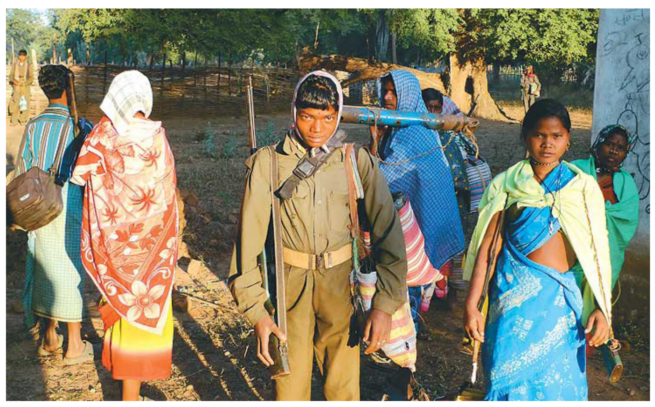
A village militia, the "base force" of the People's Liberation Guerilla Army.

Enter Mahendra Karma, one of the biggest landlords in the region and at the time a member of the Communist Party of India (CPI). In 1990 he rallied a