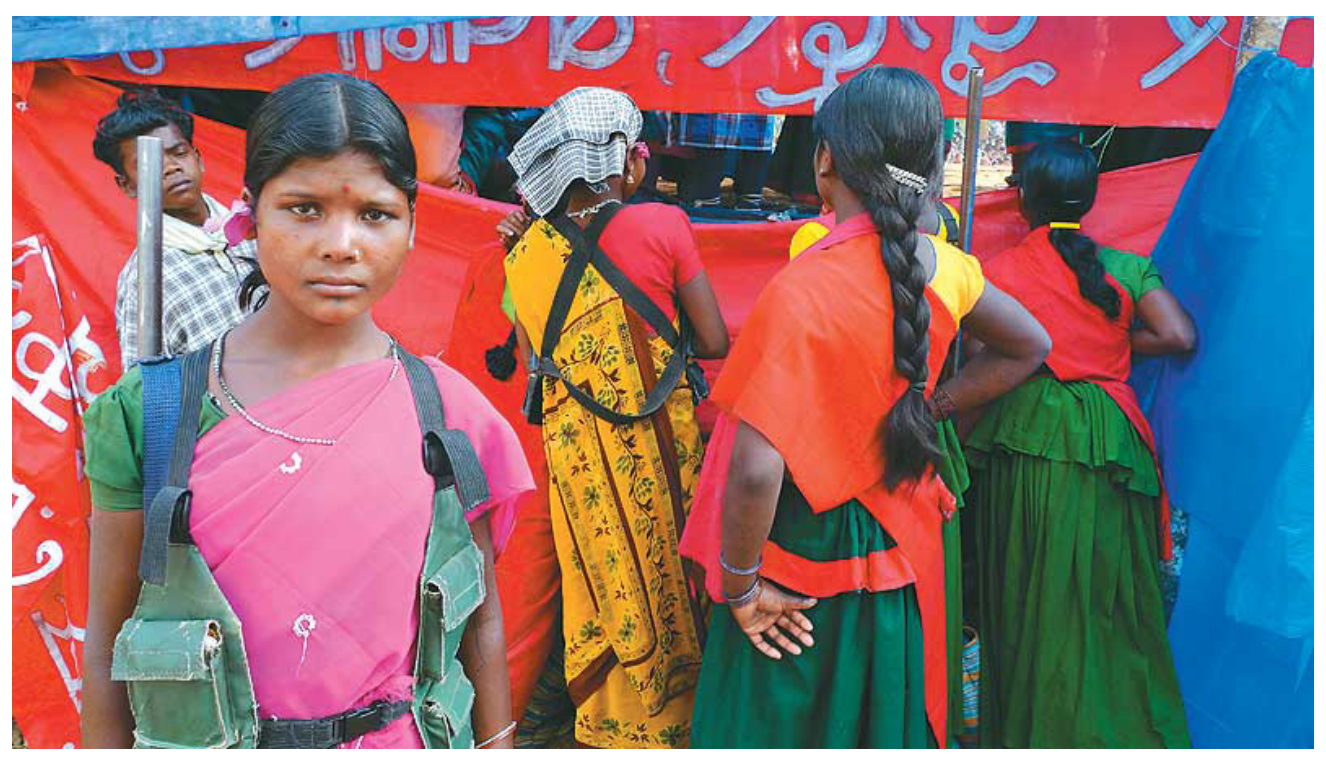
On the Day of the Bhumkal: Face to face with "India's greatest Security Threat."

pride in training street dogs to fight 'terrorists.' Eight hundred policemen graduate from the Warfare Training School every six weeks. Twenty similar schools are being planned all over India. The police force is gradually being turned into an army. (In Kashmir it's the other way around. The army is being turned into a bloated, administrative, police force.) Upside down. Inside out. Either way, the Enemy is the People.