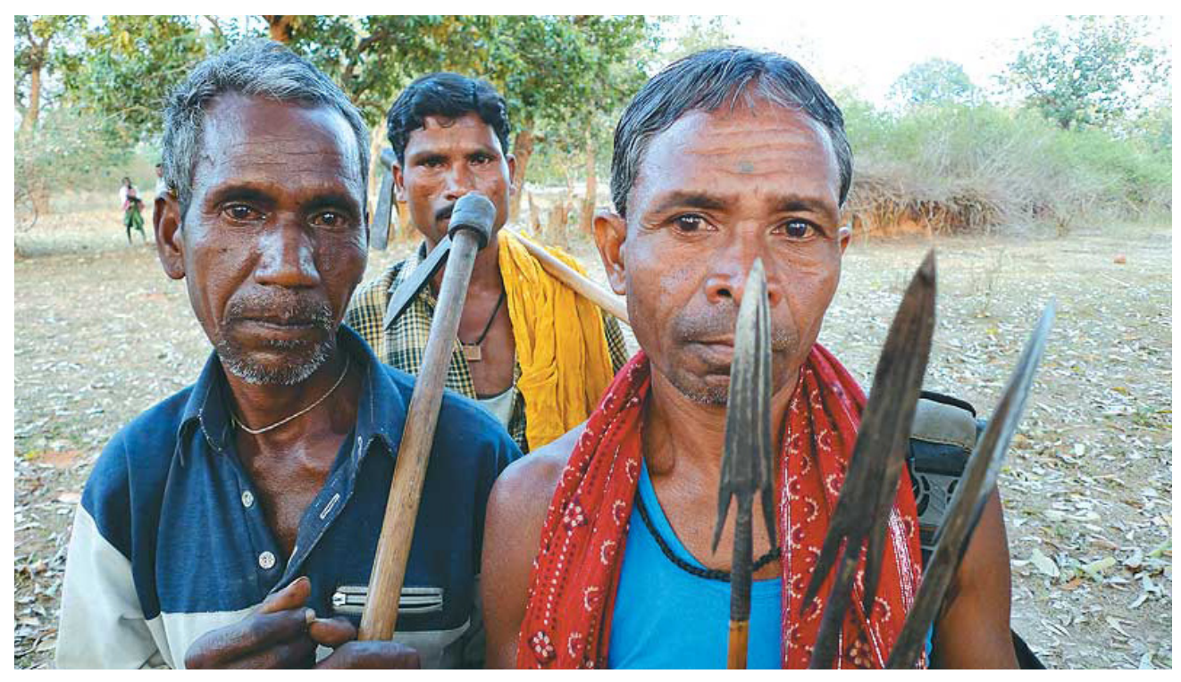
Villagers from the submergence areas of the proposed Bodhghat dam.

Bhumkal day, I can't help thinking that his analysis, so vital to the structure of this revolution, is so removed from its emotion and texture. When he said that only 'an annihilation campaign' could produce "the new man who will defy death and be free from all thought of self-interest"— could he have imagined that this ancient people, dancing into the night, would be the ones on whose shoulders his dreams would come to rest?