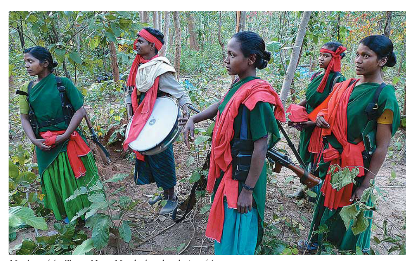
Members of the Chetna Natya Manch, the cultural wing of the party.

Then good news arrives. A small contingent of people with a plump young man. He's in fatigues too, but they look brand new. Everybody admires them and