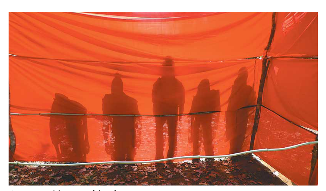
Centenary celebrations of the adivasi uprising in Bastar.

In Dantewara the police wear plain clothes and the rebels wear uniforms. The jail-superintendant is in jail. The prisoners are free (three hundred of them escaped from the old town jail two years ago). Women who have been raped are in police custody. The rapists give speeches in the bazaar.