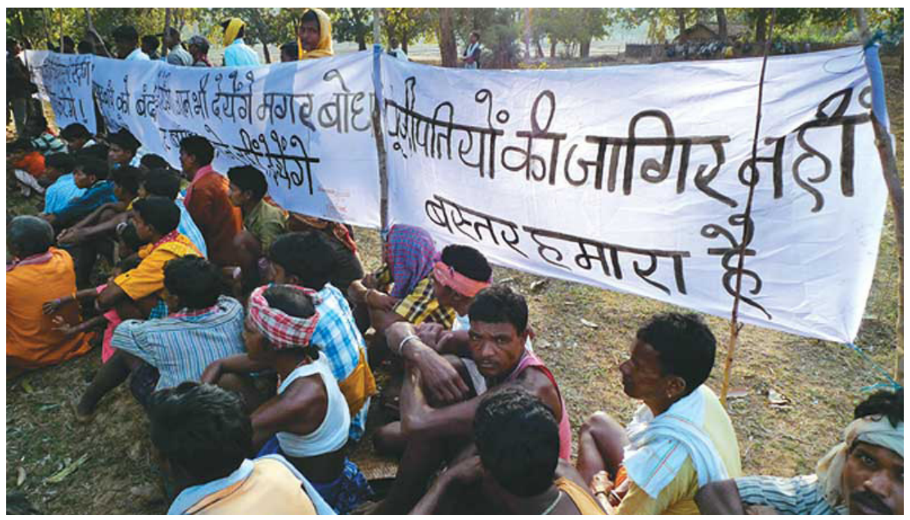
People of Kudur village protest the Bodhghat dam: "It does not belong to the capitalists, Bastar is OURS."

The most recent expression of concern has come from the Home Minister P. Chidambaram who says he doesn't want tribal people living in 'museum cultures'. The well-being of tribal people didn't seem to be such