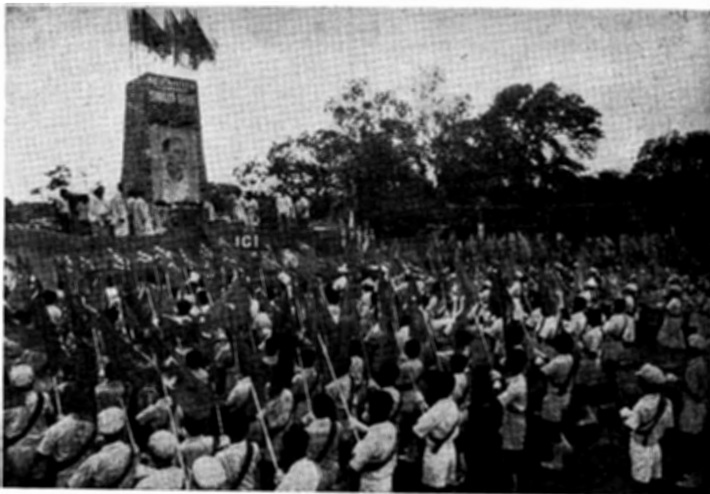
Komsomal, Young Communist League of SUCI is paying guard of honour to the portrait of Comrade Shibdas Ghosh. On the dais leader of the Central Committee and other state leaders are extending Red Salute

The Central Committee of our party, Comrade Dasgupta said, had laid down a programme of countrywide democratic mass movement against the government's anti-people policies and measures. In different states the governments were cracking down on these movements. Our party workers were