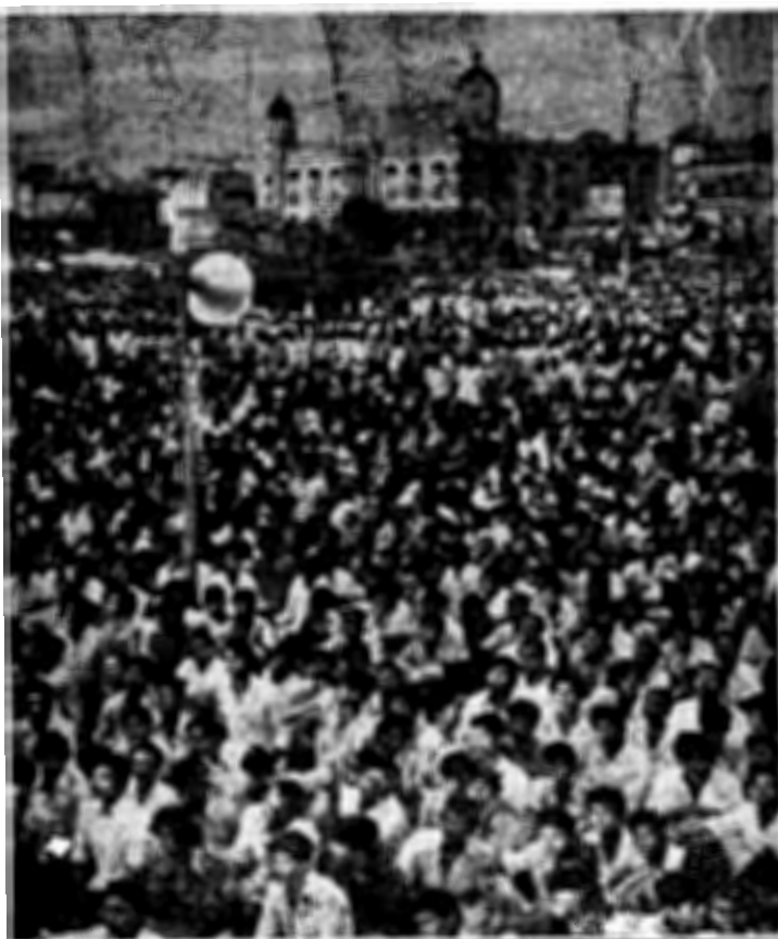
Sukomal Dasgupta (below) addressing the meeting.