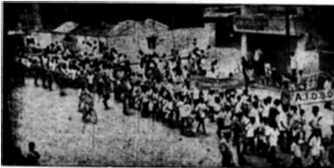
A portion of the large demonstration of students at Kurnool, Andhra Pradesh