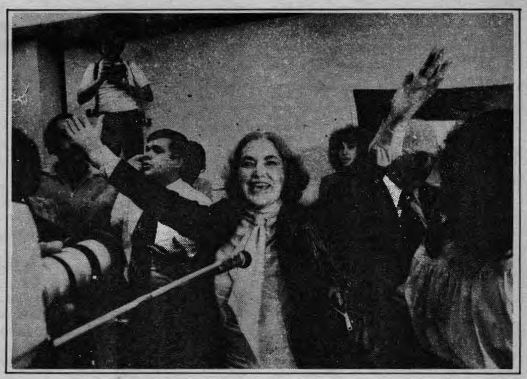
Lolita Lebron liberated

The heroes achieved their task fully. On November 2nd, both the United States and world press not only covered the daring