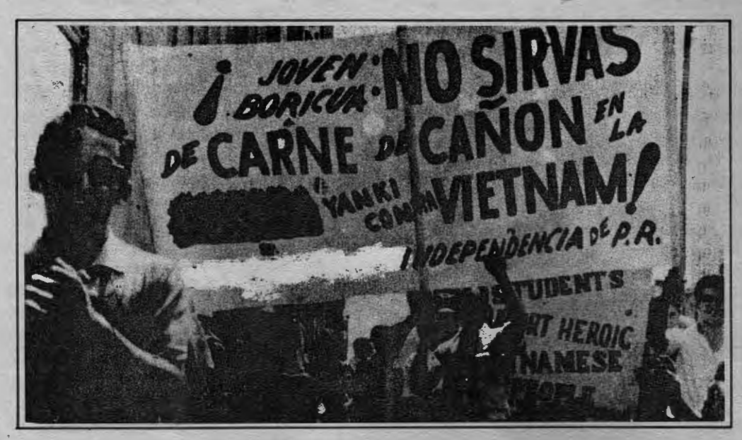
Puerto Ricans demonstrating in the US

Once out of Chicago, however, the patriot softened his tone, and although he was on occasion to repeat his statements, he