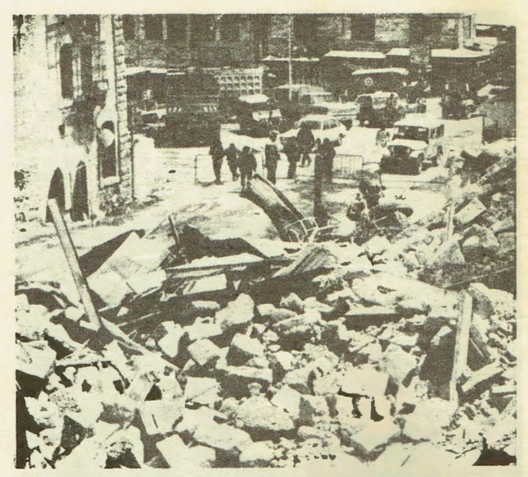
Houses destroyed by the occupation forces following the May 2nd operation

"The imperialist, Zionist and Sadat alliance safeguards not only the imperialist inte-