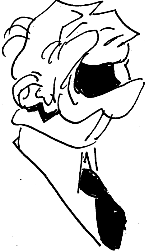
THE SENATE AT WORK