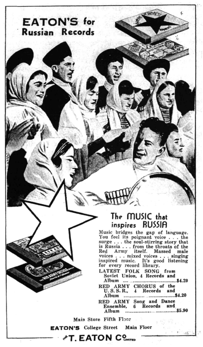
"Toronto Jewish Folk Choir Program Cover, 1944." Eaton's and Simpson's took out full page ads each year.