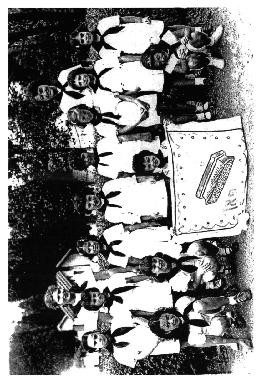
"Camp Kinderland, N.Y., 1949." Author is third from left, second row. The flag says "Raynkait Fon" (Cleanliness Flag) for Group 4.