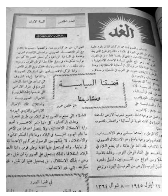
Al-Ghad, monthly journal of the League of Arab Intellectuals, September 14, 1945.

in Palestine. The Jewish community, beneficiary of British promises and policies, was eager for more British support, and regarded it as Britain's duty to come to its defense. Its opposition to the British Mandate in its final years grew out of a feeling of betrayal. For Arab nationalists, all Jewish immigration to Palestine was illegitimate and they could not conceive of political rights for members of the immigrant community, not only collectively, but also on an individual level.